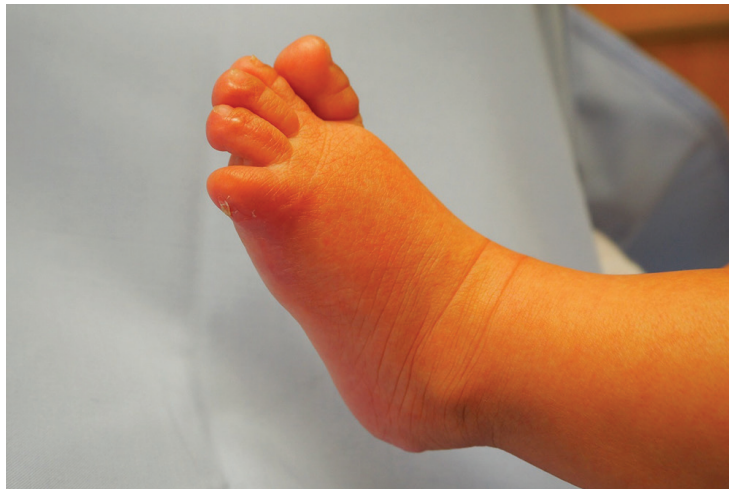
Fig. 2: Lateral foot margin three months after burn. Lateralization of the toenail and complete re-epithelialization.