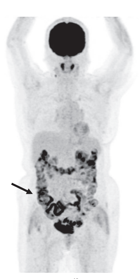
Figure 2 | Representative image of <sup>18</sup>F-labeled fluorodeoxyglucose positron emission tomography of an individual taking metformin. The image was obtained from a 70-year-old woman with type 2 diabetes and paraganglioma who was taking 1,000 mg of metformin daily. The arrow indicates accumulation of <sup>18</sup>F-labeled fluorodeoxyglucose in the colon.

glucose absorption from the intestine is no longer recognized as a principal mechanism underlying the glucose-lowering effect of metformin, advances in imaging technology have shown that metformin influences glucose handling in the human intestine. It was thus found, again by chance, that the accumulation in the colon of <sup>18</sup>F-labeled fluorodeoxyglucose, a non-metabolizable derivative of glucose, is markedly augmented after metformin administration (Figure 2)<sup>7</sup>. Whereas both the underlying mechanism and the significance to glucose metabolism of this observation remain to be determined, this finding indeed suggests that metformin affects the handling of glucose in the colon.