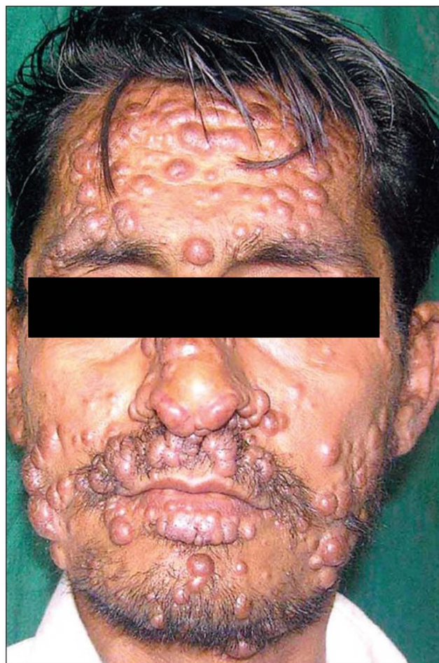
Figure 4. Diffuse or disseminated cutaneous leishmaniasis in an HIV-positive patient from Rajasthan, India (endemic for CL, not VL). There are florid nodules mainly on the face and on the extremities and back; oral and nasopharyngeal infiltrations were also found. There was no previous ulcer nor were there signs of visceralization. The parasite was not typed.

The clinical manifestations of cutaneous leishmaniasis and mucocutaneous leishmaniasis may differ in HIV infection with the degree of reduction in CD4 count as an important factor. For CL, while in some reports no difference in clinical manifestations is seen between immunocompetent and immunosuppressed patients, in others, more lesions or more severe lesions are seen [85–87]. In a study from French Guyana, HIV-infected patients had similar localized CL as in matched HIV-negative controls with 1 MCL case (all had L. guyanensis infection; all HIV infected patients had