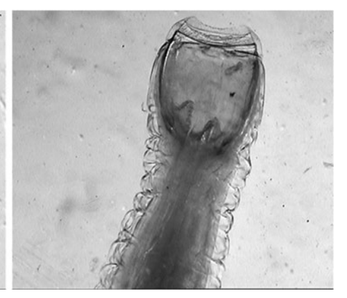
Fig. 2 The buccal cavity of large strongyles from the genus Strongylus: S. vulgaris, S. edentatus, and S. equinus