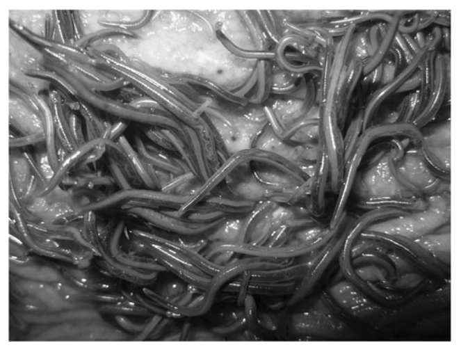
Fig. 3 Strongylidae on the mucosal membrane of the cecum

Not many postmortem examinations of horses focused on prevalence of individual species of strongyles belonging to the genus Strongylus performed in Poland indicate S. vulgaris as the dominant species. In the present studies involving a large number of animals, the extensiveness of this nematode infestation was 22.8 % making it markedly lower in comparison to a 60 to 78 % prevalence reported by others ((Gawor 1995; Gawor et al. 2006; Gundlach et al. 2004; Sobieszewski 1967). The extensiveness of S. edentatus infestation amounted to 18.3 % and was similar to that (20 to 22 %) evidenced earlier in the Lublin Region (Gundłach et al. 2004; Sobieszewski 1967). However, Gawor 1995 found twice higher prevalence amounting to 40 % in the 1990s, but more current studies failed to evidence the nematodes; this controversy may result from the procedure used by the authors (Gawor et al. 2006). Current studies indicating a low prevalence of S. equinus (extensiveness, 1.7 %) confirm our earlier observations which failed to find the nematodes in horses from the Lublin Region (Gundłach et al. 2004) and are in contrast to other reports showing S. equines in 14 to