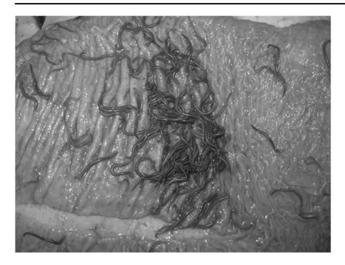
Fig. 4 Strongylidae on the mucosal membrane of the abdominal stratum of the large colon

lowering prevalence in numerous regions of the world. This view is reliably confirmed by the data reported in Germany where S. vulgaris and S. edentatus were frequently found until recently whereas, now, these nematode parasites occur rarely or are not found in many regions (Schnieder 2006). Similar results were evidenced in Australia indicating a dramatic decrease in prevalence of the genus Strongylus during the last decades (Boxell et al. 2003; Bucknell et al. 1995; English 1979). The widespread infestation of strongyles is affected by several variables including the occurrence of drug-resistant strains (Gawor 2006). The lack of drug-resistant strains is a result of long life cycles of these nematode parasites and