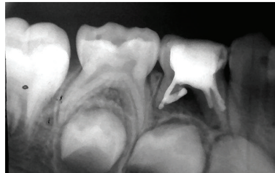
FIGURE 4: Obturation of the #84.

Within the oral cavity, foreign bodies may be embedded in the soft or hard tissue. Objects impacted within the periodontium are a potential source of infection and may lead to edema, hemorrhage, and abscess formation. In addition, foreign bodies in primary teeth can lead to the perforation of the pulp chamber floor space and possible trauma to the developing permanent dentition, depending on developmental stage. Trauma to the tooth in the initial stages of odontogenesis can destroy the permanent tooth bud completely or may result in disorganization of the tooth germ, forming a complex odontoma.