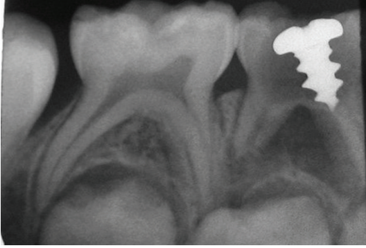
FIGURE 1: IOPA showing metallic screw in the pulp chamber of #84 with intact pulp floor.