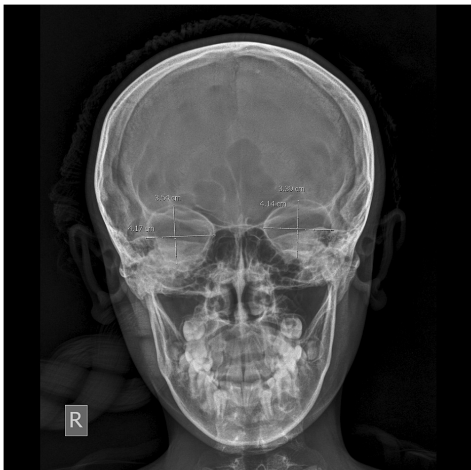
FIGURE 1: Frontal digital radiograph of skull showing the orbital margin and measurement of orbital height and width.

The orbital height was measured from the frontal film as the distance between the superior and inferior orbital margins; it is perpendicular to its width and similarly divides the orbit into two halves. The orbital width was also measured from the same frontal film as the distance between the midpoint of the medial margin of the orbit to the midpoint of the lateral margin. The OIs were calculated from the data collected using the following formula: OI = (\text{height of orbit}/\text{width of the orbit}) \times 100 . The interorbital distance, that is, the minimum distance between the medial walls of the orbits (distance between the left and right dacryon), and biorbital distance, that is, the maximum distance between the lateral walls of the orbits (distance between right and left ectoconchion), were also measured (Figure 2).