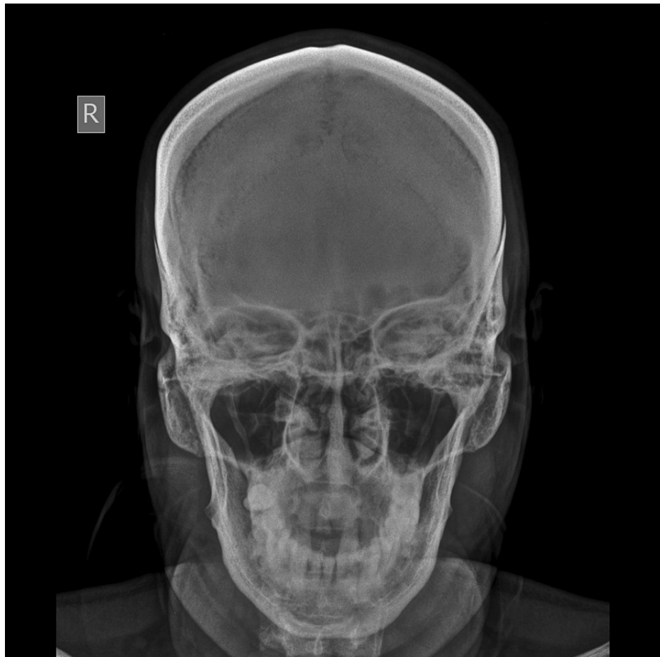
FIGURE 3: Transversely elliptical orbit.