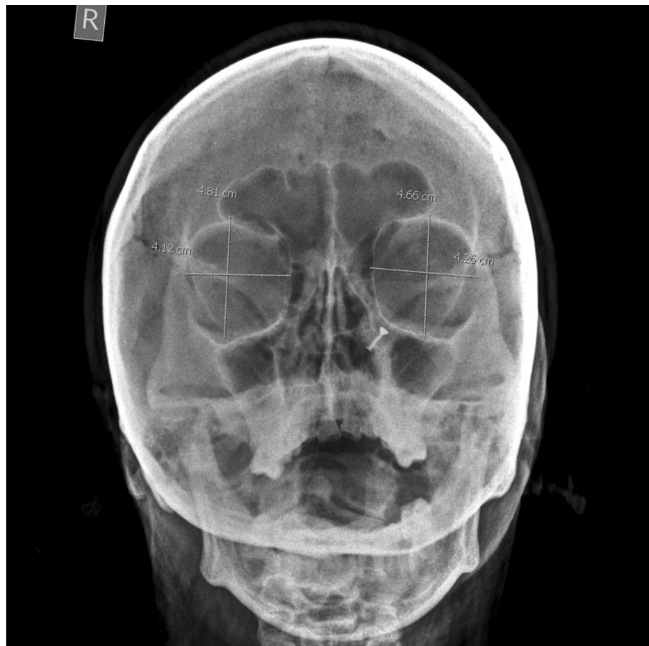
FIGURE 5: Square-shaped orbit.

Round orbits were mostly found in lower age groups (10-29 years). As the age advances, gradual changes in shape were noted from round to elliptical in the age group of 30-49 years and becoming rectangular in the later age group (50-59 years). Variations were also observed in the contours of the orbit. The inferior contour of the orbit, formed by the maxilla and zygoma, showed maximum variability, followed by the medial margin. The superior contour, formed by the frontal bone, showed the least variability. Orbital shape showed a significant gender difference in all age groups except in the 10-19 years age group.