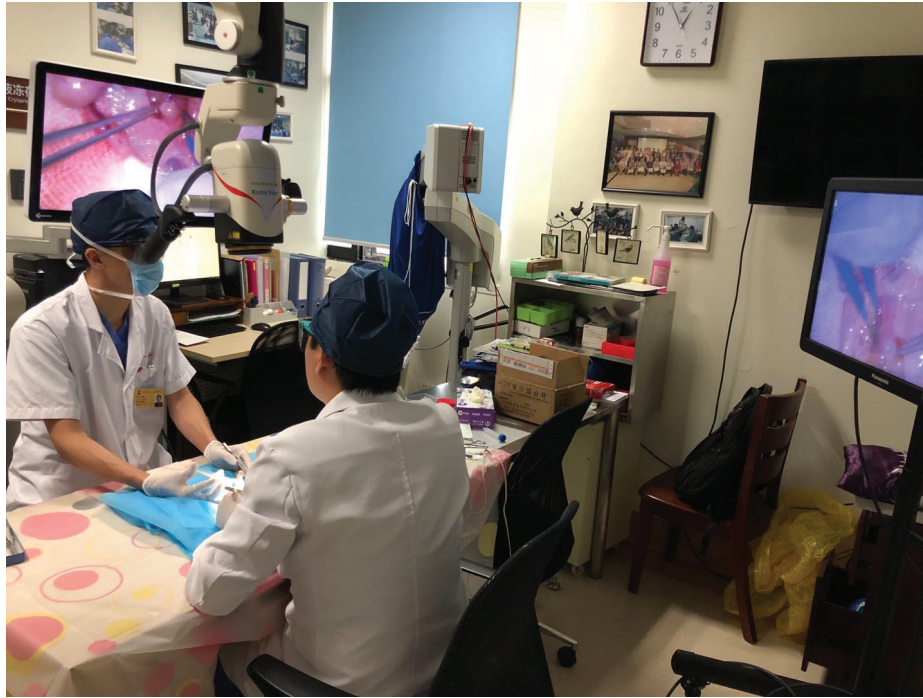
Supplementary Figure 1: Lab setup with the 3D-DIM. The telescope, which is attached to its holding arm and comes from the assistant's right side, is held over the surgical field. The assistant sits on the opposite side of the surgeon. The surgeon controls the microscope with the use of a foot pedal. One video monitor is positioned on the surgeon's side, and another is positioned on the assistant's side. 3D-DIM: three-dimensional digital image microscope system.