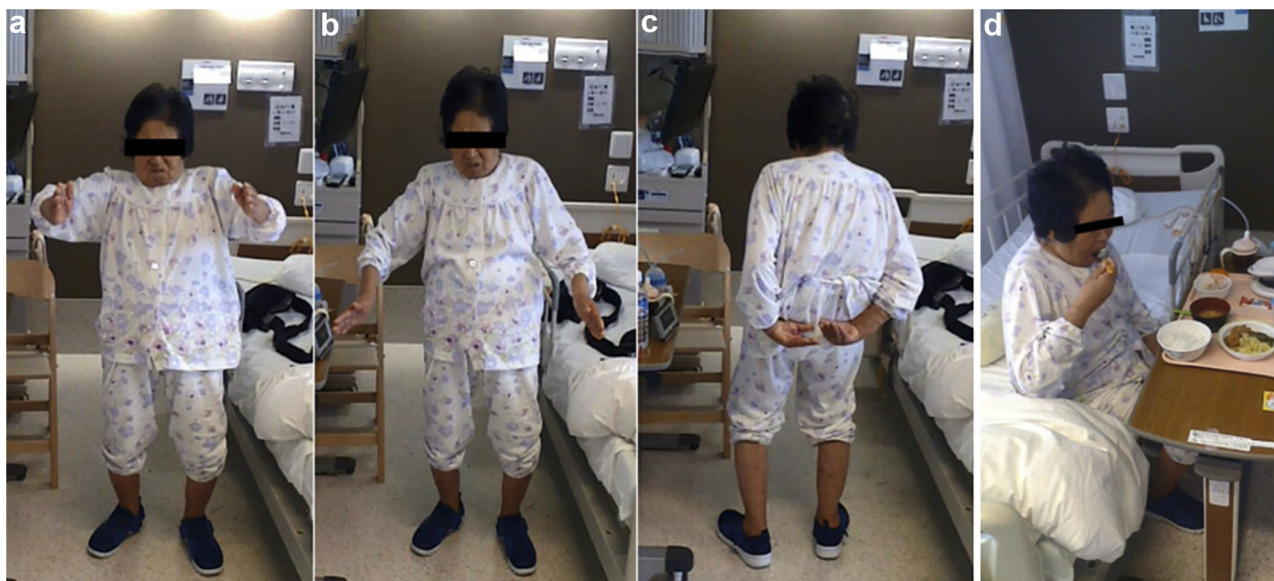
Figure 3 Four weeks after surgery. Photographs demonstrate active anterior elevation (a), abduction (b), and internal rotation (c). (d) The patient was able to feed herself.