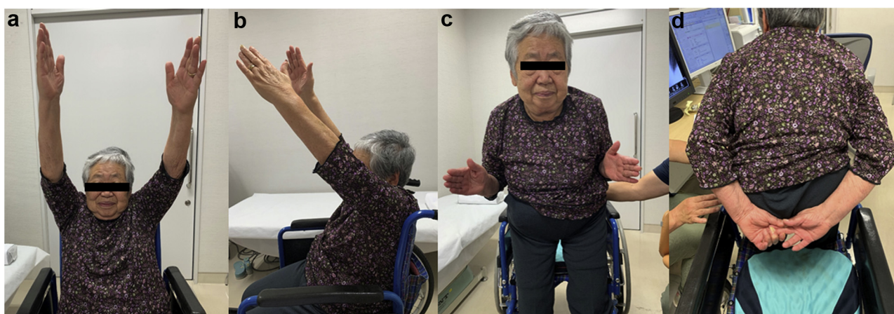
Figure 4 Four years after surgery. Photographs demonstrate active anterior elevation (a, b), external rotation at side (c), and internal rotation (d).