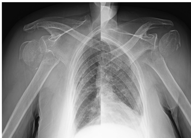
Figure 1 X-ray image of bilateral comminuted proximal humeral fractures (4-part according to Neer's classification).

region of the bone, the stem was fixed to the shaft with cement (Cobalt Bone Cement; Zimmer Biomet) at a retroversion angle of 20 degrees. After stem repositioning, cancellous bone gathered from the humeral head was grafted to the proximal part of the stem. The GT was repaired by suturing between the tuberosities and between each tuberosity and the diaphyseal region with No. 2 high-strength suture material. The cut end of the supraspinatus tendon was sutured to the infraspinatus tendon. A drain was inserted before closing the wound. RSA was subsequently performed in the left shoulder in the same way. The total operation time was 5 hours, 16 minutes and total blood loss was 365 ml. The patient did not need intraoperative or postoperative blood transfusion. She did not have any perioperative complications.