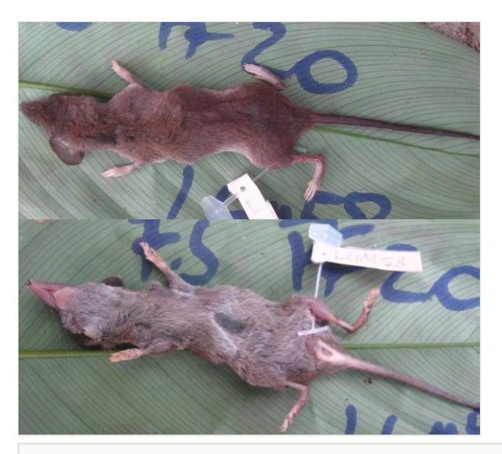
Figure 2. doi Dorsal and ventral view of Crocidura sp1 yoko (LEGM458, Mukinzi 2014).

Crocidura sp1 yoko has easily distinguishable characteristics: small size (4-6 g), brownish on the back, greyish-brown on the belly, brownish tail that is completely glabrous, except from the base which is covered with few small vibrissae, the down side of the tail clear, almost white at the base and around the anus and its small paws are equally light coloured (Fig. 2). Its skull resembles that of Crocidura ludia but is smaller (Mukinzi-Itoka 2014).