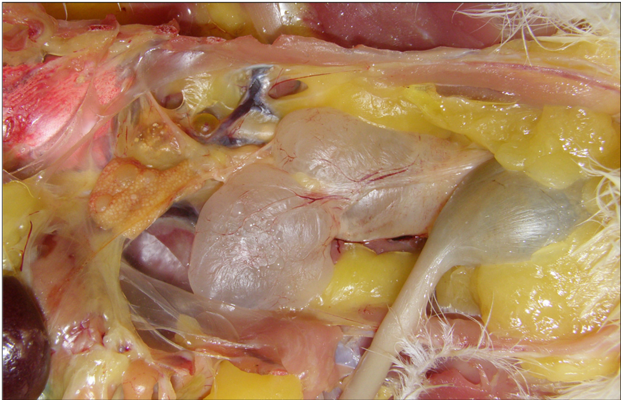
Fig. 3. Cystic dilation of the oviduct in SPF chickens that were infected with the nrTW I strain.

The nrTW I strain was isolated from chickens that had been vaccinated against IBV with the commercial live attenuated H120 vaccine at 1 day of age and then boosted at 14 days of age (Xu et al., 2016), possibly indicating that the vaccine does not provide sufficient protection against a challenge with strain nrTW I. Thus, further examination of the protection conferred by commercially available IBV vaccines and attenuated viruses against challenge with the novel serotype nrTW I strain was important for evaluating