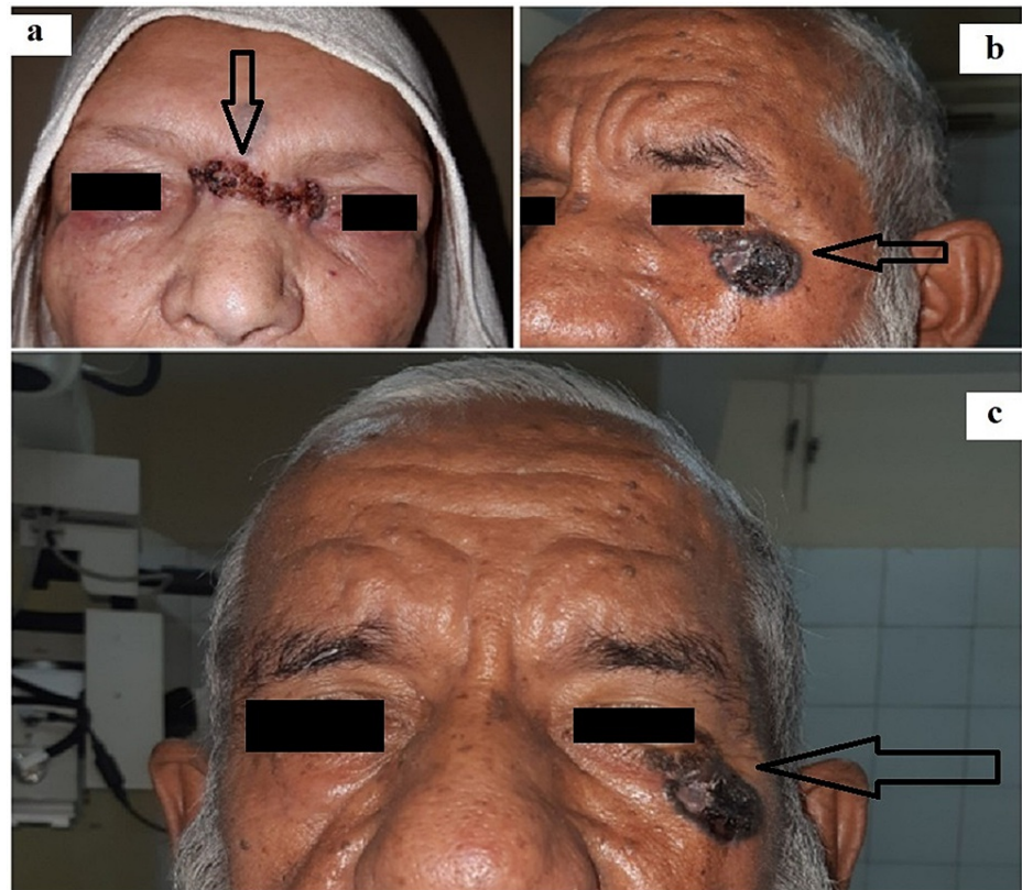
FIGURE 1: Frontal view of female patient with a lesion of 3.5 cm × 1.5 cm (a), lateral view of male patient with a lesion of 3 cm × 2 cm (b), frontal view of male patient with lesion over left lower lid (c).

After taking informed consent, the patients were evaluated and prepared for surgery. A single-staged surgery with excision and reconstruction was planned. The surgery was performed under local infiltrating anesthesia (2% lidocaine with epinephrine at 1:200,000). Firstly, we marked the boundaries of the malignant tissue for wide excision with a sufficient four millimeters (mm) lesion-free margin and then carefully excised along with the markings. In the first case, after taking the template from the defect, a slightly larger sized left nasolabial flap was designed from the orbicularis muscle, with its acentric pedicle at the upper end near the lesion, while the tail of the flap was at the lower end, which was rotated 90 degrees on its axis to cover the defect. Whereas in case two, a zygomatic flap was recruited adjacent to the lesion, laterally, with its acentric pedicle near the defect to rotate at 90 degrees, as shown in Figures 2A-2D.