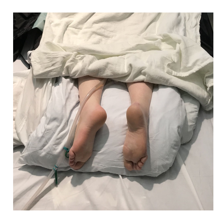
FIGURE 5 Additional padding can be placed under the anterior lower legs to prevent hyperextension of the ankles

hyperextension of the ankles by placing additional support under their dorsal surface (Figure 5).