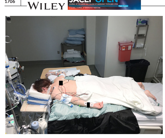
FIGURE 2 A prone patient in the swimmer's position

For patients who cannot self-prone, 5 or more staff members will usually be required to safely turn the patient with 2 on each side and 1 at the head of the bed. This maneuver should be practiced before implementation in your department to ensure the safety of the patient and staff members. With the necessary staff in place, the following steps should be followed<sup>21-26</sup>: