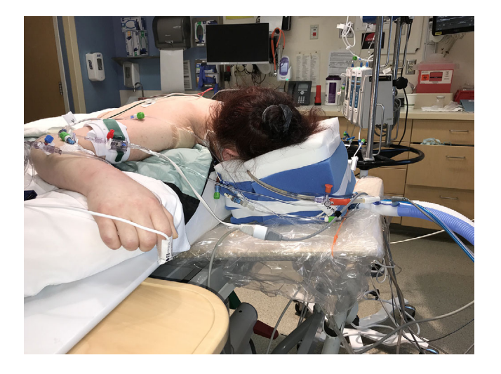
FIGURE 3 A mechanically ventilated patient on a foam proning pillow