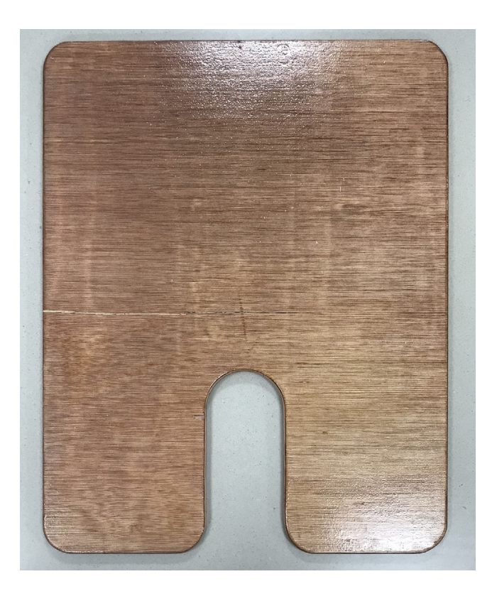
FIGURE 4 A proning board can be placed under the head of the bed for mechanically ventilated patients in order to better position and secure tubes and lines