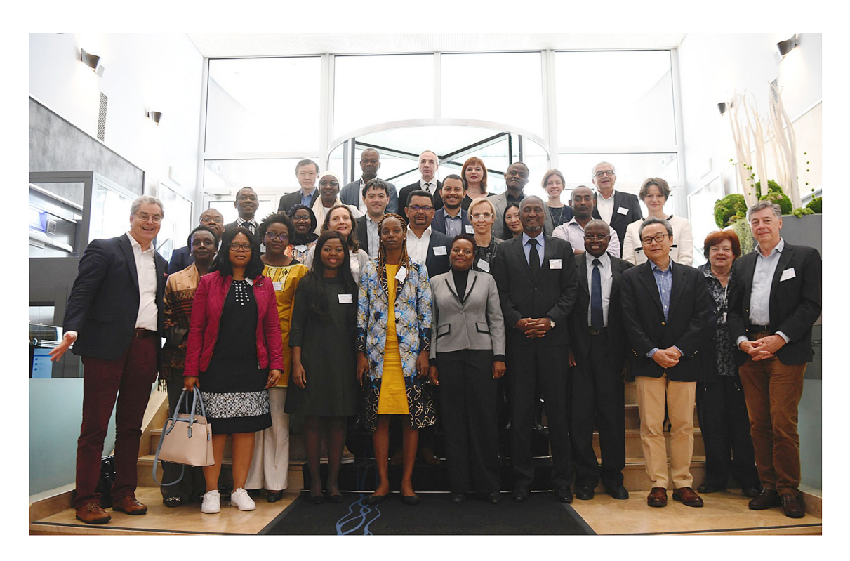
Figure 1 Group photo, Novotel Genève Centre.

'eczemas' in the WHO non-NTD chronic conditions list, which probably includes many cases of contact allergy and other eczematous conditions, remains a problem, compounded by the lack of validated diagnostic criteria for AD adapted to black African skin and environments. In addition to difficulties with diagnosis, barriers to the implementation of therapeutic education include, as for NTDs, poverty, inadequate facilities, shortage of skilled health workers, illiteracy, language and cultural barriers. The possibility of following an 'integrated' approach, as for NTDs, by better education of primary healthcare workers, including using digital technologies, may improve appropriate primary patient care and patient referral to specialists when necessary.<sup>7</sup>