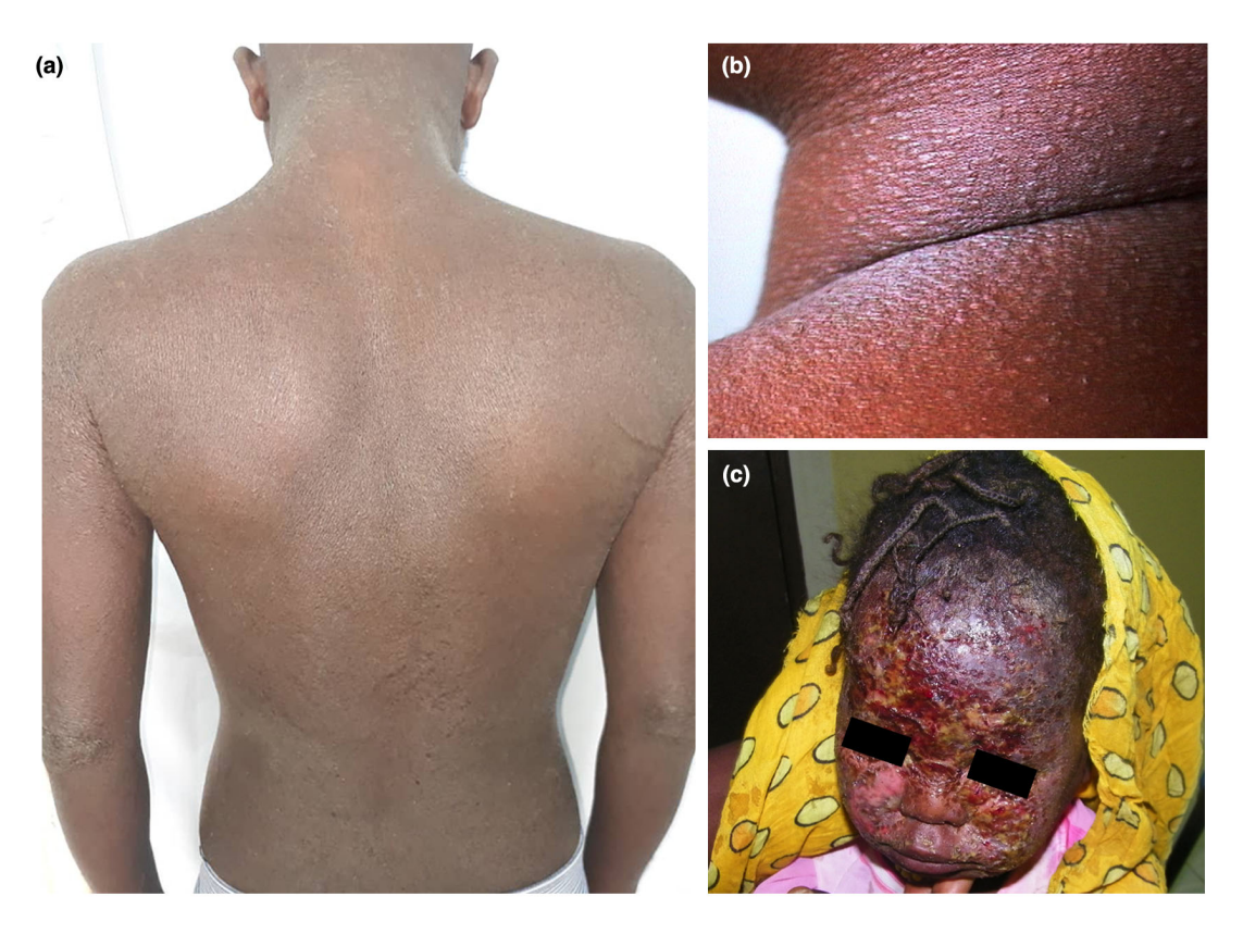
Figure 3 (a) erythroderma after herbal therapy, (b) papular AD and (c) severe bacterial superinfection in childhood AD.

The major differential diagnoses cited by participants besides contact eczema are scabies, insect bites, actinic lichen planus,