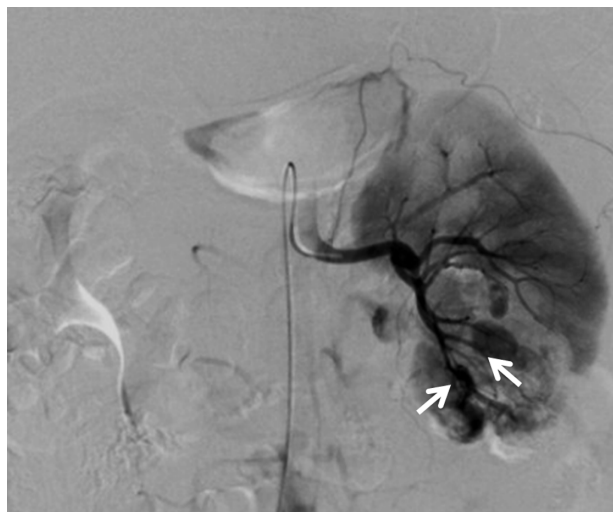
Figure 1 Before treatment two segmental renal arteries, both the anterior and the posterior branches, were injured, (the arrows point to the bleeding sites).

Renal arteriography presented as injuries to the segmental or distal renal arteries, including injuries to the anterior branch in seven cases, to the posterior branch in five cases, to both the anterior and the posterior branches in three cases, and to the renal artery trunk in one case. In the one patient complicated with pelvic fracture, hemorrhage rose from rupture of the internal iliac artery branch, and in the patient complicated with liver rupture, hemorrhage rose from rupture of the right hepatic lobe. Blood pressure, hemoglobin and hematocrit became stable within 1 hour of embolization in all cases, and macroscopic hematuria disappeared completely 1 day after surgery in all 16 cases. There was one patient who died of cerebral trauma 3 days after surgery, although