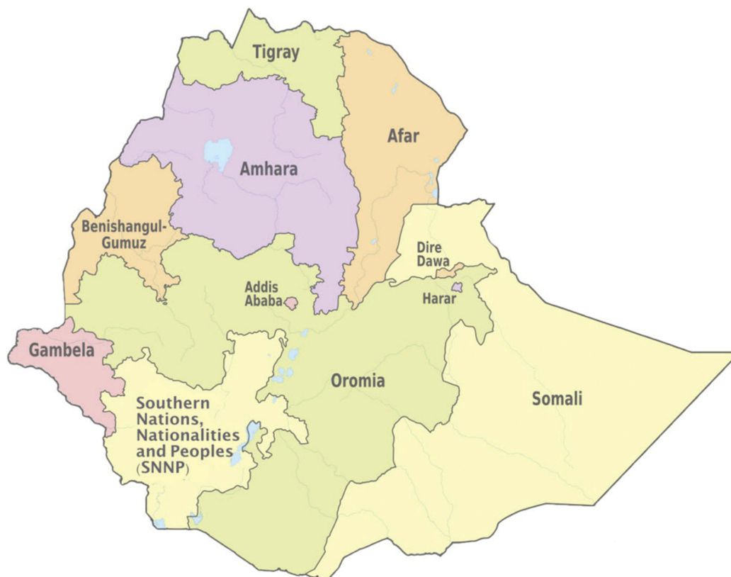
Figure 1 The maps of regional states in Ethiopia.

Despite various efforts made to prevent childhood diseases in Ethiopia, the prevalence has persisted since 2011. 4,21 Our findings showed that there is a huge disparity in the distribution of ARIs in children across the different regional states of Ethiopia. The highest prevalence of ARI, 16.8%,