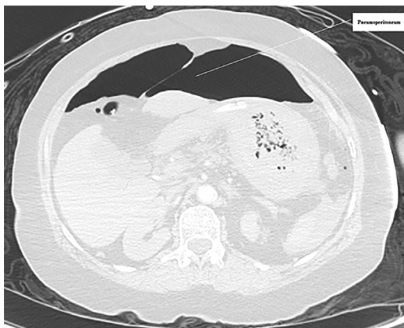
Fig. 1. Pneumoperitoneum post CPR.