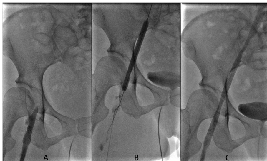
Fig. 3 a A case of venous complication: angiographic showed the thrombosis in right iliofemoral vein. b The vein was dilated using an angioplasty balloon catheter. c Unobstructed of the right iliofemoral vein after covered stent implantation

Greelish and colleagues reported a 3.9% incidence of femoral artery injury during femoral artery cannulation [13]. In our study, all patients with femoral artery cannulation were treated using the modified Seldinger technique. Relevant research suggests that femoral artery cannulation offers a safe alternative to aortic cannulation for CPB and is especially important in MICS [14]. The biggest issue with femoral artery cannulation is that many people question the risk of increased mortality, neurological complications and embolism [15, 16]. Different from cannulation in patients with aneurysms and