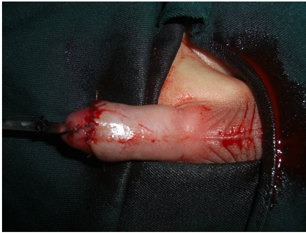
Figure 3 The completed Mathieu repair with synchronous circumcision.

(one case in Group A, one case in Group B). Preputial edema not causing any phimosis was seen in 19 cases (44%) in Group B, which was transient in all cases and improved spontaneously within 2 weeks. No foreskin reconstructions were deemed to be phimotic, implying that these could be retracted. Preputial necrosis was seen in one case (2.3%) in this group of patients (Table 1). Forty patients in Group B underwent the second stage of circumcision 6 months after the primary repair. Circumcision of the three remaining cases was refused by the parents. The cosmetic result was acceptable in all patients from Group A in the opinions of the parents and the physician. For religious/social reasons, all of the parents in Group B were opposed to prepuce preservation before surgery. However, for health reasons, and also the prospective financial burden of second surgery, synchronous circumcision was preferred by 12 (28%) parents of Group B cases postoperatively. The difference in complications between the two groups was statistically significant ( P \leq 0.05 ). All patients were left with a terminal glans meatus, albeit a stenosed meatus in two cases.