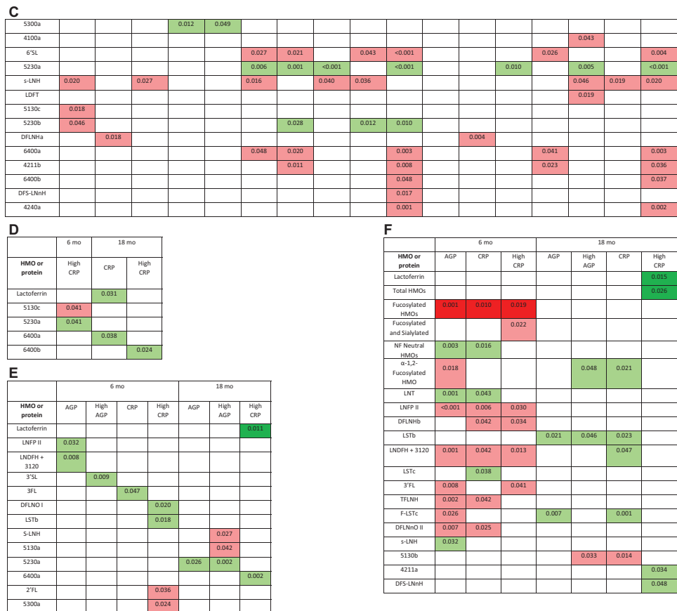
FIGURE 1 Associations of human milk oligosaccharides (HMOs) and bioactive proteins at 6 mo with infant morbidity and markers of inflammation in 659 Malawian mother-infant dyads: morbidity outcomes in all participants (A) for milk constituents that did not differ between secretors (positive for the functional enzyme encoded by the FUT2 gene) and nonsecretors; morbidity outcomes in secretors (B) and nonsecretors (C) for milk constituents that differed between secretors and nonsecretors, or for which there was a significant interaction between the milk constituent and secretor status; markers of inflammation in all participants (D) for milk constituents that did not differ between secretors and nonsecretors; markers of inflammation in secretors (E) and nonsecretors (F) for milk constituents that differed between secretors and nonsecretors, or for which there was a significant interaction between the milk constituent and secretor status. Only shown are the milk constituents that were significantly associated with \geq 1 of the outcomes. HMOs are ordered from highest to lowest relative abundance. Associations of outcomes with the bioactive proteins, total abundance of HMOs, and relative abundance of fucosylated HMOs and sialylated HMOs were considered primary analyses. All others were considered exploratory analyses. For the associations of morbidity outcomes, P values were determined by negative binomial models using continuous morbidity data for all associations except incidence of fever and diarrhea from 6 to 7 mo, which were calculated using logistic regression with binary morbidity data. For the associations of markers of inflammation, P values were determined by multiple linear regression models for continuous AGP and CRP data and logistic regression for binary outcomes. P values are from models that were adjusted for covariates, with a level of significance <0.05 . Associations in dark green are primary analyses that were in the positive direction and remained significant after the Benjamini–Hochberg correction for multiple hypothesis testing. Associations in light green are exploratory HMOs that were in the positive direction or primary analyses that did not remain significant after correcting for multiple hypothesis testing. Associations in pink are exploratory HMOs that were in the negative direction. Associations in red are primary analyses that were in the negative direction and remained significant after the Benjamini–Hochberg procedure. HMOs identified by numbers have not been previously named. Their composition is given as hexose_ N -acetylhexoseamine (HexNAc)_fucose_ N -acetylneuraminic acid (sialic acid). For example, 5311 has 5 hexoses, 3 HexNAc, 1 fucose, and 1 sialic acid. Thus, those with a nonzero number in the last position are sialylated; those with a nonzero number in the third position are fucosylated. AGP, \alpha -1-acid glycoprotein; ARI, acute respiratory infection; CRP, C-reactive protein; DFLNH(a,b,c), difucosyllacto- N -hexaose (a,b,c isomers); DFLNnO, difucosyllacto- N -neooctaose; DFLNO, difucosyllacto- N -octaose; DFpLNH, difucosyl- para -lacto- N -hexaose; DFS-LNnH, difucosylmonosialyllacto- N -neohexaose; F-LNO, fucosyllacto- N -octaose; F-LST, lactodifucotetraose; LNDFH, lacto- N -difucohexaose; LNFP, lacto- N -fucopentaose; LNH, lacto- N -hexaose; LNnH, lacto- N -neohexaose; LNT, lacto- N -tetraose; LST(a,b,c), sialyllacto- N -tetraose(a,b,c isomer); MFLNH, monofucosyllacto- N -hexaose; MFpLNH, fucosyl- para -lacto- N -hexaose; NF, non-fucosylated; p-LNH, para -lacto- N -hexaose; s-LNH, monosialyllacto- N -hexaose; S-LNnH, sialyllacto- N -neohexaose; TFLNH, trifucosyllacto- N -hexaose; 2'FL, 2'-fucosyllactose; 3'FL, 3'-fucosyllactose; 3'SL, 3'-sialyllactose; 6'SL, 6'-sialyllactose.