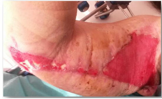
Fig. 3. Traumatic right upper arm wound image on 25 days after admission.

treated with hyperbaric oxygen therapy, voriconazole 250 mg twice daily orally and antibacterial therapy. Imipenem-cilastatin and oral ciprofloxacin were continued. The clinical outcome was favorable with the disappearance of purulent wound drainage