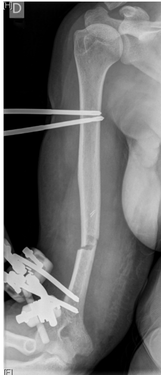
Fig. 4. Bone radiograph of distal humerus on 25 days after admission.

(Fig. 3) and she was discharged 25 days after her admission. Overall, she was treated with three months of antibacterials and nine months of voriconazole. An adjunctive treatment with hyperbaric oxygen therapy was performed. The skin had healed after six weeks. External fixation was removed after six weeks with a humeral nonunion repair by double external fixation (Fig. 4).