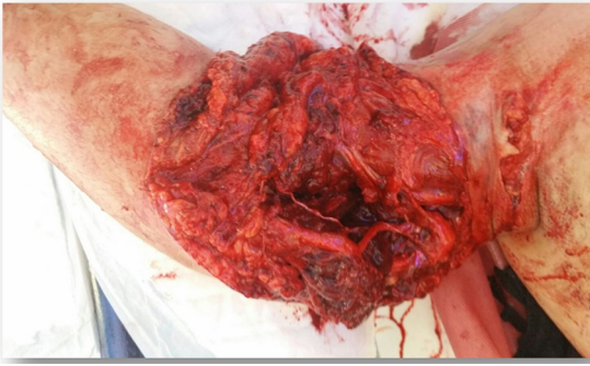
Fig. 1. Traumatic right upper arm wound image.