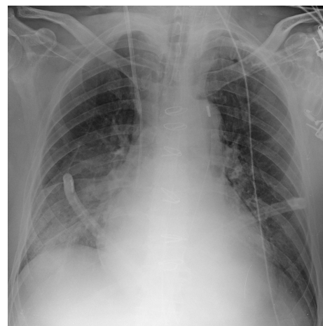
Figure 1. Chest radiograph performed in the recovery room showing a right basal pleural effusion.

Here, we present a case of symptomatic PAP after Swan-Ganz placement in a patient who underwent heart surgery and was treated percutaneously by deploying an amplatzer vascular plug (AVP) and transcatheter N -butyl cyanoacrylate (NBCA) injection.