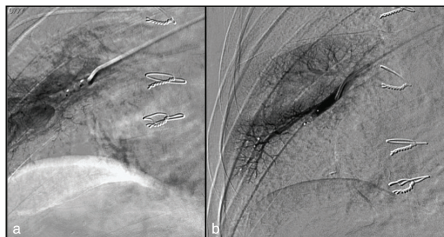
Figure 5. The angiogram performed following plug deployment documented persistent filling of the pseudoaneurysm (a); the angiogram performed after embolization with N -butyl cyanoacrylate revealed complete embolization (b).

The case was presented to our interventional radiology team, and an angiogram was performed. Using the right common femoral vein approach, a 7 French sheath was deployed; a 100-cm vertebral-shaped catheter (Cordis, Miami Lakes, FL) was introduced into the right PA and an angiogram was performed. The first angiogram did not reveal the PSA. CBCT angiography (Allura Xper FD20 Philips, Best, The Netherlands) revealed the PSA and helped the operators to catheterize the correct branch of the right PA (Figure 3). Specifically, following catheterization of the medial segment branch of the right middle lobe PA, the PSA was identified (Figure 4). A 4-mm AVP IV (AGA Medical Corp., Plymouth, MN) was deployed. Several angiograms were performed within the next 10 min; they revealed persistent filling of the PSA. Superselective catheterization was undertaken with a 2.7 French coaxial microcatheter (Progreat, Terumo, Tokyo, Japan); 0.2 ml of Glubran II (GEM, Viareggio, Italy) was injected. The angiogram was performed immediately following this procedure and it confirmed complete embolization (Figure 5). The patient remained asymptomatic and was discharged 2 days later.