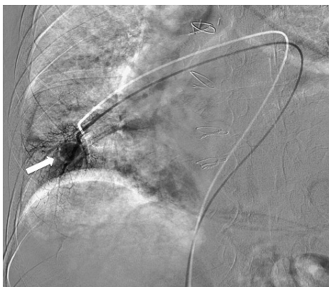
Figure 3. Coronal view of cone-beam CT angiography documenting the pseudoaneurysm.

Figure 4. Angiography following selective catheterization of the medial segment branch of the right middle lobe pulmonary artery showing the pseudoaneurysm (arrow).