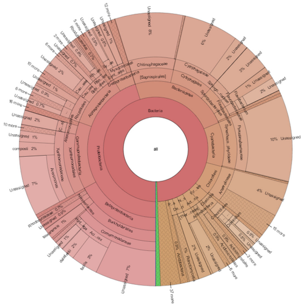
Fig. 2. Community composition in Taptapani hot spring metagenome