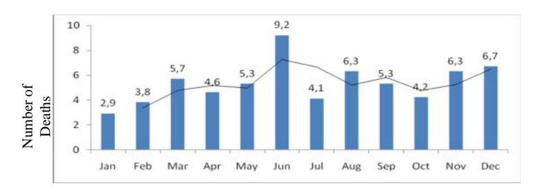
Fig. 1: Relationship between deaths and winter

Among all deaths, the sex ratio was almost 3.1 men (n=3453): 1 woman (n=1113). Out of all deaths, 62.9 %( n=2872) were attributable to NCD, while 37.1% ( n=1694) were attributable to CD: the ratio NCD/CD being 1.7. The NCD had 22 deaths in age <30 years, 2422 deaths in age 30-64 years, and 428 deaths in age>65 years. There was an inverse relationship between CD deaths and ages: 1345 deaths in age<30 years, 309 deaths in age 30-64 years, and 40 deaths in age>65 years. The ratio of NCD/CD deaths in men was 1.3(n=1951 NCD vs. 1502 CD). The ratio of NCD/CD deaths in women was 1.9 (n= 735) NCD vs. 378 CD). The peak of deaths was observed in June (winter season) between 2002 and 2006 (Fig. 1).