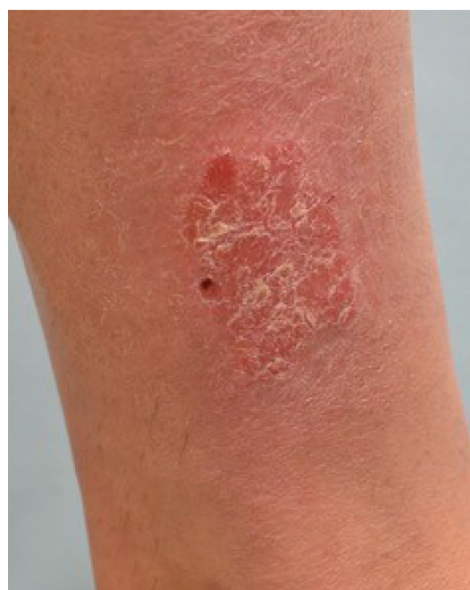
Figure 1 Plaque type psoriasis on lower extremity prior to treatment with excimer laser.

Bonis et al were the first to study the use of the 308 nm XeCl excimer laser in the field of dermatology in 1997. They investigated the use of excimer laser for treatment of 10 patients with chronic plaque psoriasis and concluded that it was an effective treatment option. 15 Since its initial introduction to dermatology, use of the excimer laser as a treatment option has expanded to applications in many dermatologic diseases. Psoriasis treatment with excimer laser has proven to be effective even in early studies with Feldman et al demonstrating 84% of patients achieving a 75% or better improvement after 10 or fewer treatments (Figures 1 and 2). Excimer laser is currently indicated for adult and pediatric patients with mild, moderate, or severe psoriasis with <10% body surface area involvement and the American Academy of Dermatology states the level of evidence is II and the strength of recommendation is B. A literature search on PubMed was used with combinations of the terms "excimer", "excimer