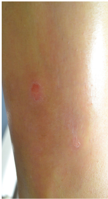
Figure 2 Plaque type psoriasis on lower extremity after eight treatments with excimer laser according to MED protocol.

Abbreviation: MED, minimal erythema dose.