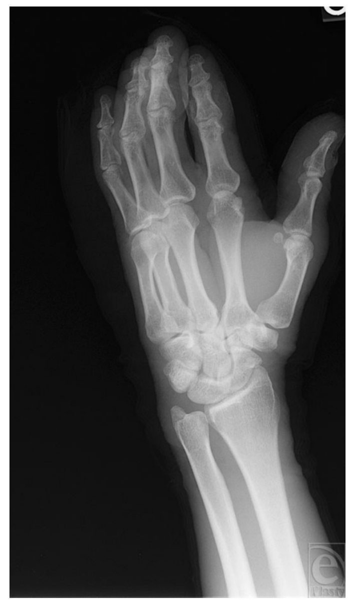
Figure 6. Postextraction x-ray film demonstrates no bony injury.

uncomplicated cases is advised, while inpatient observation may be indicated in cases of a more significant nature.