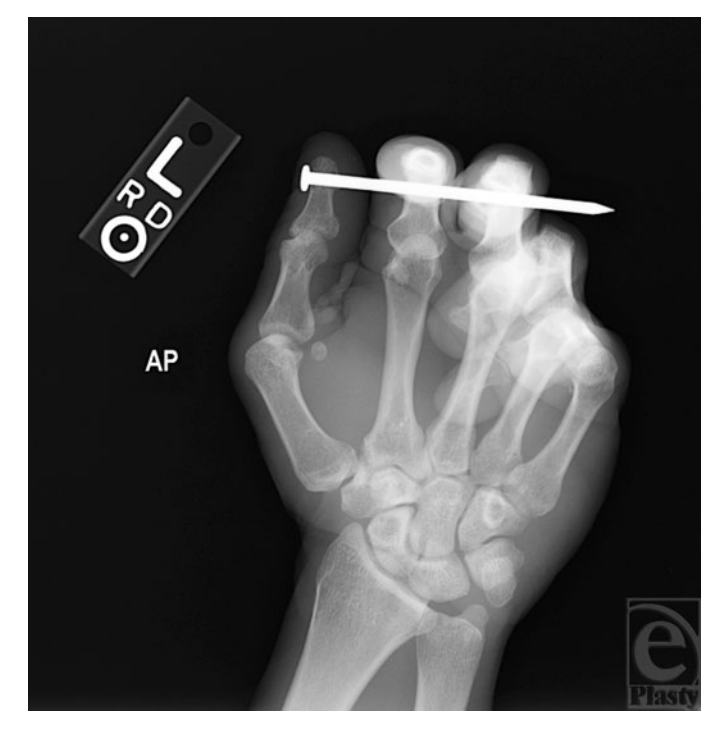
Figure 4. X-ray film demonstrates no bony injury to phalanges (AP [anteroposterior] view).

complicate the extraction of the nail.<sup>5,14</sup> Open exploration and extraction of the barb under direct vision will help avoid secondary damage.