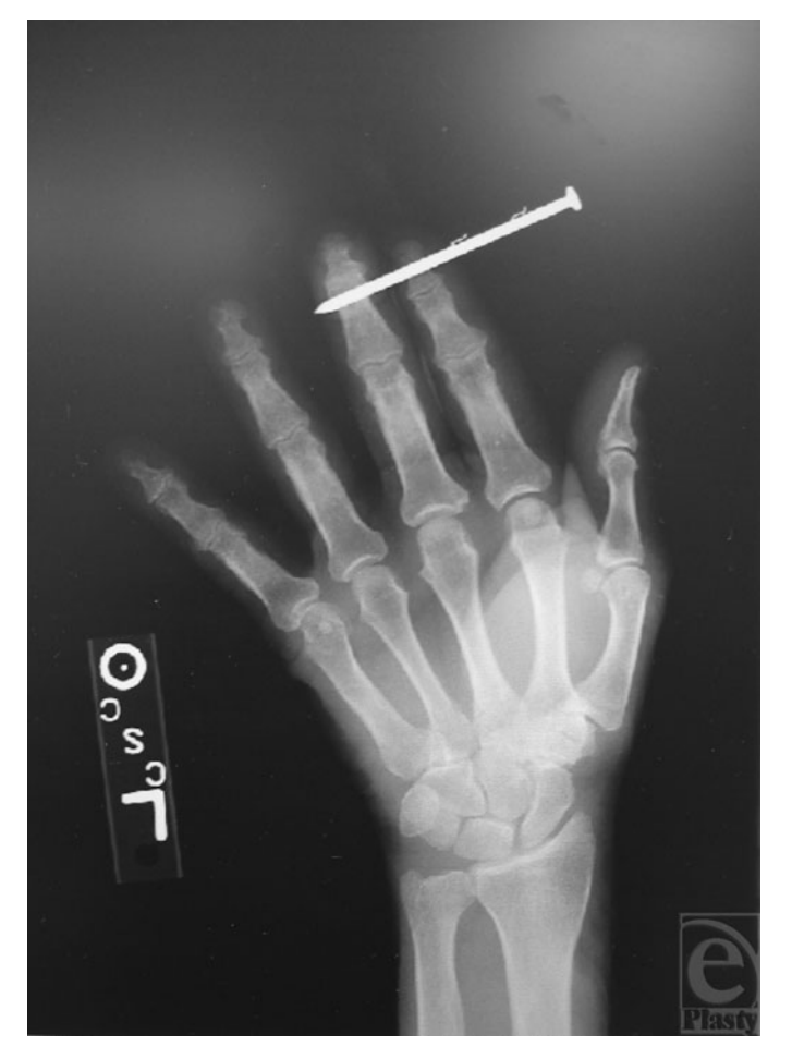
Figure 2. X-ray film demonstrates no bony injury with barbs located outside the soft tissue of the fingers.

frame construction to be 2.06 per 200,000 hours worked, 66% of these injuries involving hands and fingers.<sup>17,23,24</sup> Not surprisingly, injuries may also be underreported because workers often seek medical attention only when the injury is deep or when the nail cannot be easily removed.<sup>13</sup>