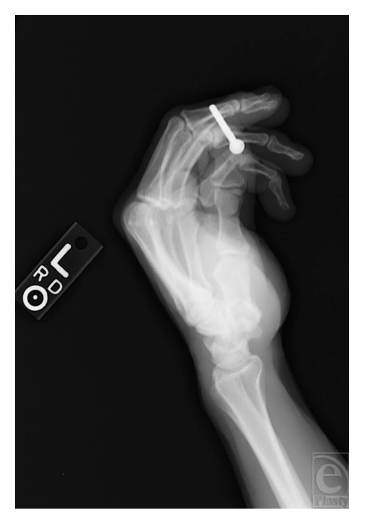
Figure 5. X-ray film demonstrates no bony injury to phalanges (oblique view).

A series of 88 nail-gun injuries to the extremities noted a low frequency of infection and rapid return of function with patients who underwent nonsurgical nail removal.<sup>10</sup> This suggests that nail-gun injuries to the extremities, when there is no articular or neurovascular involvement, can be managed with simple extraction, minimal debridement, and a short course of oral antibiotics. Specific suggestions in appropriate cases for nonoperative extraction recommend removing the head of the nail at the level of the entrance wound and withdrawing the nail slowly, in an antegrade direction, through the exit wound.<sup>2,15,20</sup>