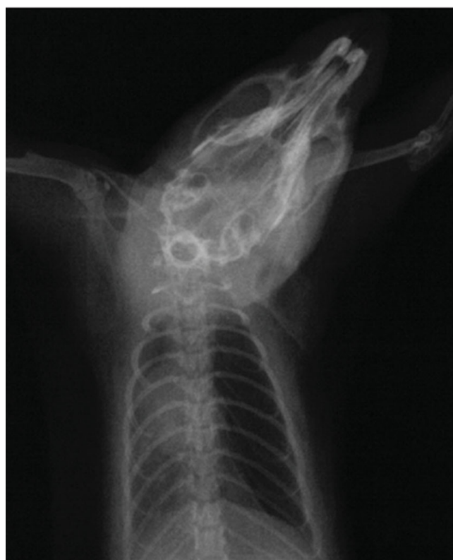
Figure 2 The confirmation of right re-expansion by chest X-ray. Re-expansion pulmonary edema is also seen.

Lung samples were embedded in paraffin blocks. Four \mu\text{m} sections were sliced from paraffin blocks and stained with hematoxylin-eosin (HE). Pulmonary edema was evaluated by a pathologist, who was blinded to groups. We have developed a "pulmonary edema score" (PES) in order to assess the degree of pulmonary edema. Briefly, each animal was classified according to the presence of above mentioned histopathological findings as minimal, moderate and advanced. Minimal pulmonary edema (score 1); included those with only fluid extravasations, moderate edema (score 2); included those with fluid extravasations and fluid in the alveoli, advanced edema (score 3); included animals that have typical histopathological findings of pulmonary edema, and eventually those with normal pulmonary parenchyma were classified as score 0.