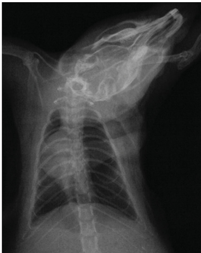
Figure 1 The confirmation of right pneumothorax by chest X-ray.

lungs were filled with 10% buffered formalin solution via intratracheal instillation, and were fixed in the same solution. Before fixation, one third of upper lobes of both lungs were kept in liquid nitrogen for analysis of oxidative stress. The RPE procedure is summarized in Figure 3.