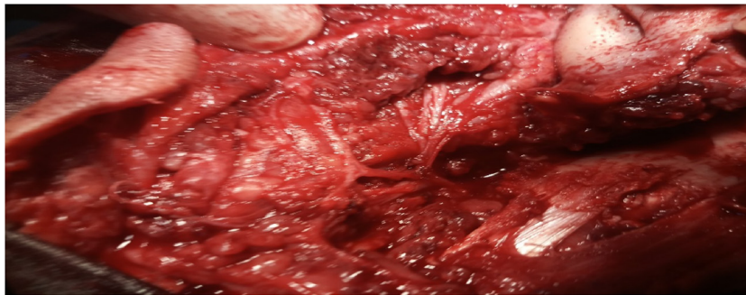
Fig. 2. The nerve branches are shown during the operation.