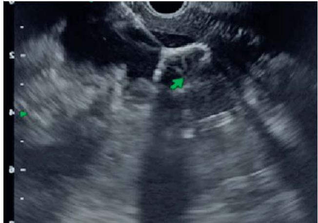
► Fig. 1 Endoscopic ultrasound image of an intracavity flange of fully covered lumen-apposing self-expandable metal stent deployed into pancreatic pseudocyst.