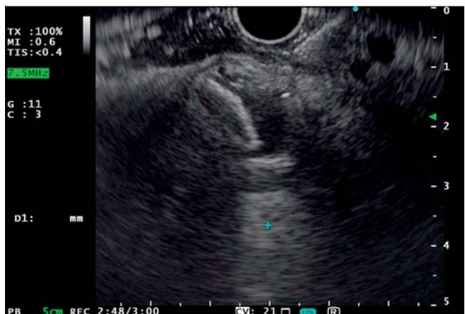
► Fig. 2 Endoscopic ultrasound image of intra-common bile duct (CBD) flange of fully covered lumen-apposing self-expandable metal stent.

assistance of endoscopic view. The scope was then gently withdrawn while the catheter control hub was slowly pushed downwards, to allow for the exit of the proximal flange (► Fig. 3 ) from the working channel to complete the release of the stent (► Video 1 ).