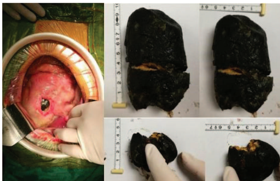
Figure 2. Perforation and lithiasis in the stomach were revealed during an operational procedure. The perforation was located on the lesser curvature, which was 5 cm × 4 cm in size.