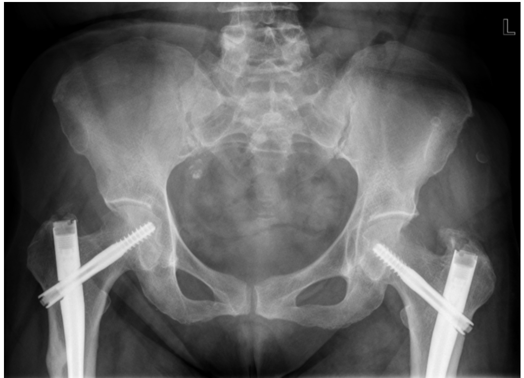
FIGURE 4: Pelvic X-ray shows intramedullary nail fixation of bilateral atypical femoral fractures

Biopsy of the lesion at the time of intramedullary nailing showed monotypic plasmacytosis in fragments of bone with <5% plasma cells (Figure 5) and M-protein 1.5 grams initially suggestive of relapse. However, a review of prior bone marrow histopathology before antimyeloma treatment demonstrated less than 30% plasma cell involvement in the bone marrow and with treatment, the patient remained in clinical remission. Given that the pathologic and radiologic features were inconsistent with myeloma osteolytic fracture and overall clinical context, the patient likely suffered AFF secondary to BP use. The patient then underwent physical and occupational therapy with good recovery.