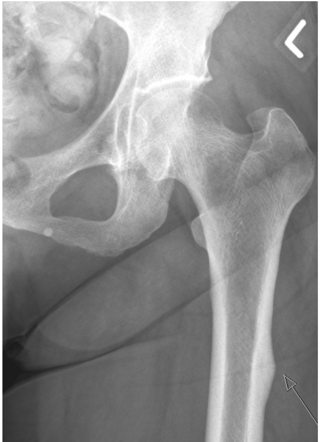
FIGURE 1: X-ray left hip shows a left atypical femoral fracture (AFF) in the proximal femur

The cortical periosteal thickening is adjacent to the faint translucent fracture that is extending from the lateral cortex into the medulla.