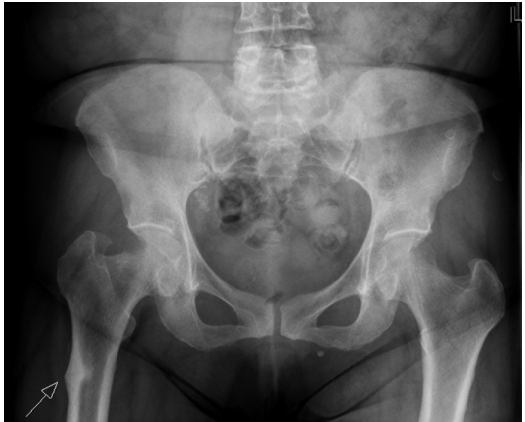
FIGURE 3: Pelvic X-ray shows bilateral atypical femoral fractures

The subsequent bone survey corroborated these findings and did not identify any other neoplastic focus. The characteristic location and presentation were suspicious for bisphosphonate-related atypical femoral fracture. Zoledronic acid was discontinued, and the patient was admitted for prophylactic intramedullary nailing of bilateral proximal femurs (Figure 4).