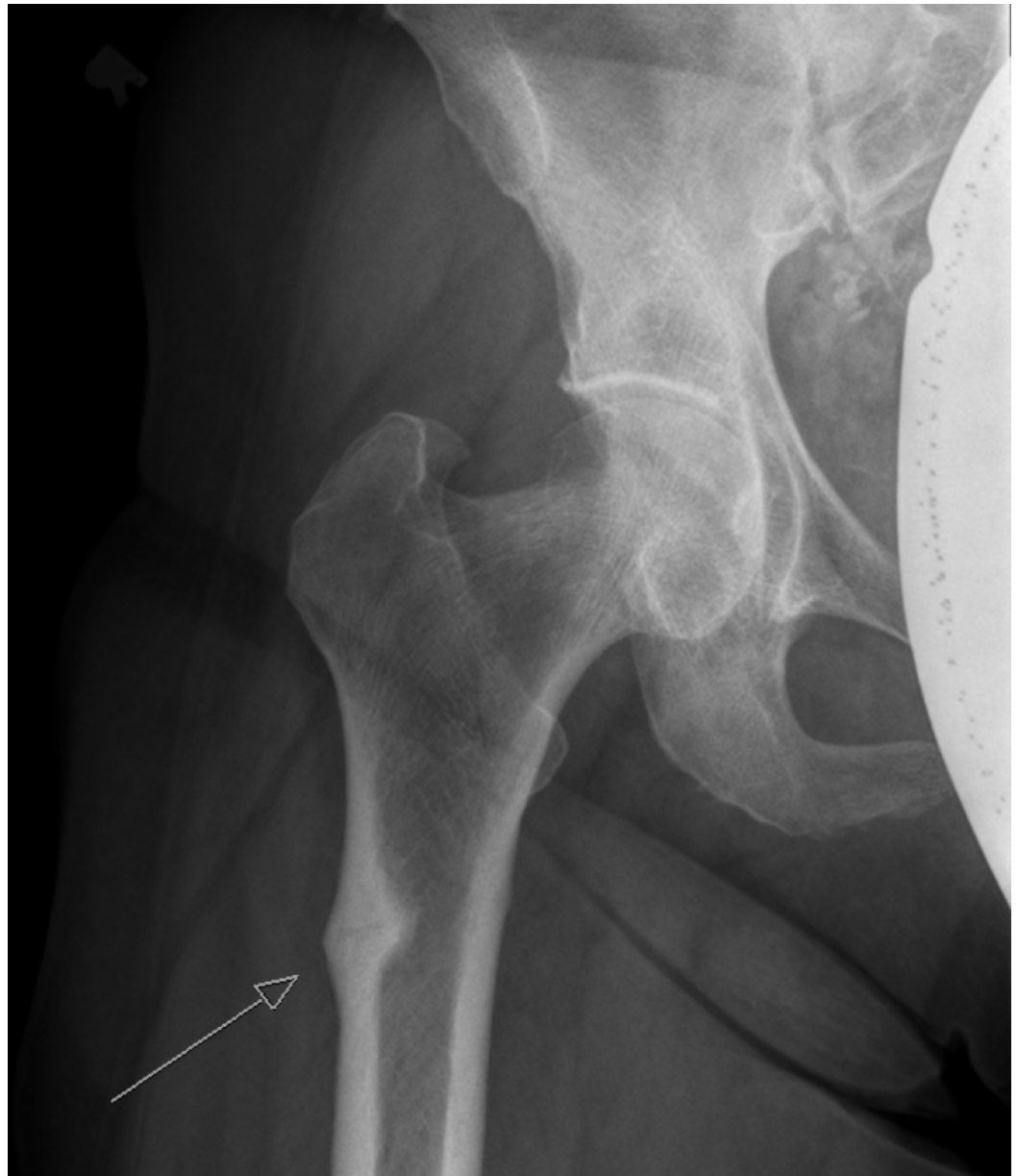
FIGURE 2: X-ray right hip shows a right atypical femoral fracture

The lateral cortical periosteal thickening and oblique fracture is more pronounced.