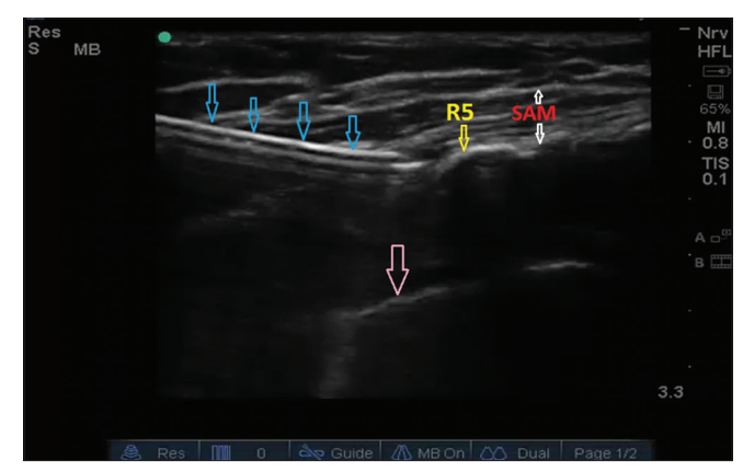
Figure 1: Showing USG guided serratus anterior plane block. (Blue arrows- needle, SAM- serratus anterior muscle, R5- fifth rib, pink arrow- pleura)

Patients in group S received US-guided SAP block within 4–6 h of admission in the ICU after an informed consent. With patient in supine position, linear US probe (5–12 mHz Sonosite, M-Turbo; Sonosite Inc.) was placed longitudinally in the midaxillary line at the level of 4–5 ribs. The ribs were measured from supraclavicular fossa (rib 1), infraclavicular fossa (rib 2), and then gradually downwards and laterally towards the midaxillary line. An 18 G Tuohy needle was inserted in plane, in the midaxillary line. The needle was coursed through latissimus dorsi, the outer sheath of serratus anterior muscle (SAM), the SAM and the inner sheath of SAM [Figure 1].