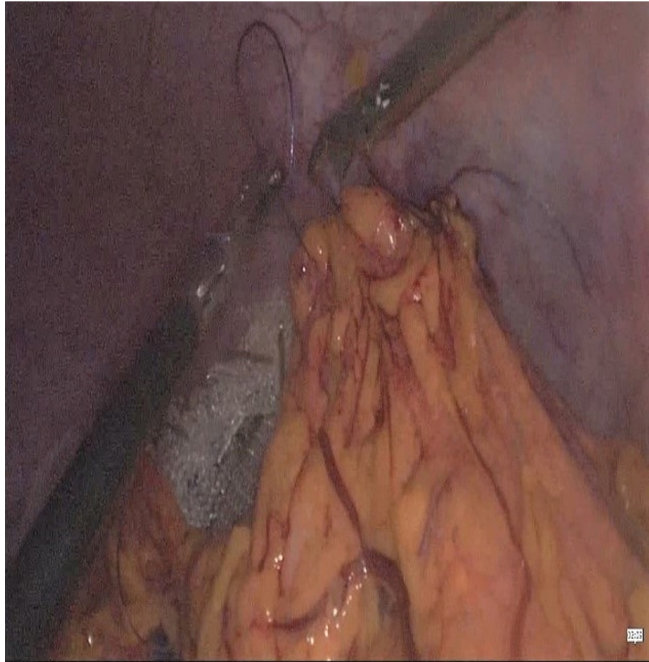
FIGURE 3: Wrapping the prolene mesh with the omentum