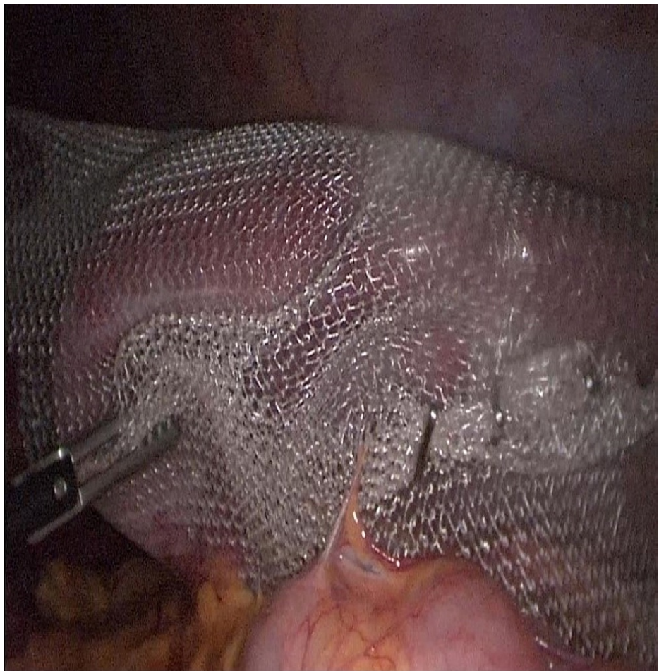
FIGURE 2: Suspension of the spleen in the left upper quadrant