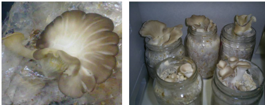
FIGURE 1: Pleurotus pulmonarius .

Most of the enzymes produced in industry are produced by submerged fermentation [8]. The use of liquid cultures facilitates the purification of bioactives such as enzymes and polysaccharides [3]. The submerged culture of P. ostreatus in wheat gluten resulted in the secretion of proteases that noticeably increased the overall solubility of the medium [13].