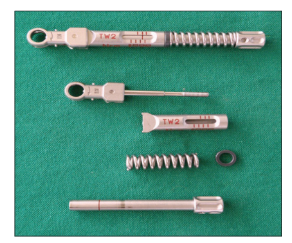
Figure 3: Dismantling of the components in Dr. Idhe devices

In Astra Tech group [Table 1] mean of difference values significantly differed from the target torque