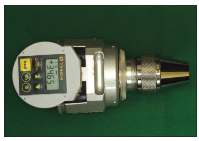
Figure 2: The digital torque gauge (Tohnichi, Japan)

Mean and range of difference between the measured torque and the targeted torque values were evaluated, considering sterilization cycles and number of use. Absolute difference is the difference in Ncm taken without regard to the sign between the measured torque value and the targeted torque value. Furthermore, algebratic absolute values of these differences were calculated.