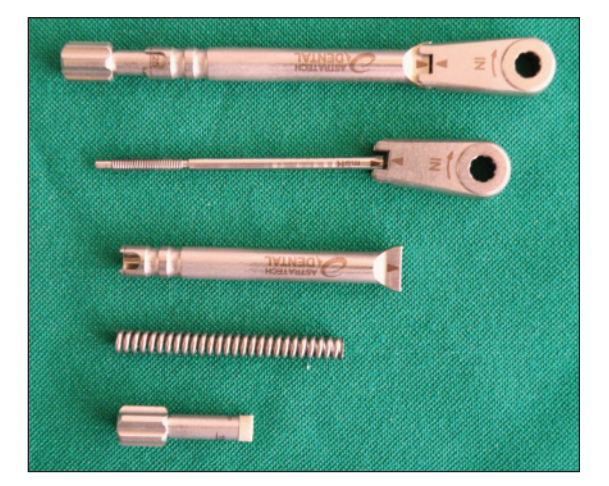
Figure 4: Dismantling of the components Astra Tech devices

Descriptive statistical analysis was used and a comparison of mean of difference with target torque in each cycle was performed with one sample t test. One-way repeated measure ANOVA, considering the type of MTLDs as a between subject comparison, was used to evaluate the absolute values of difference between devices of each manufacturer in each studied group ( \alpha = 0.05 ).