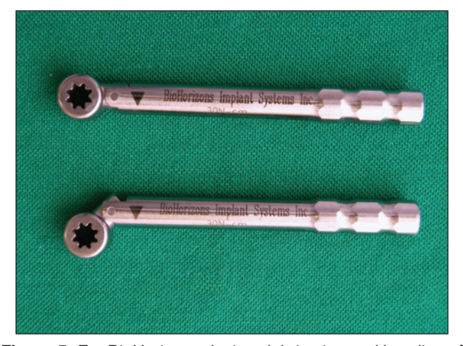
Figure 5: For BioHorizons devices lubrication and bending of the handle could be considered