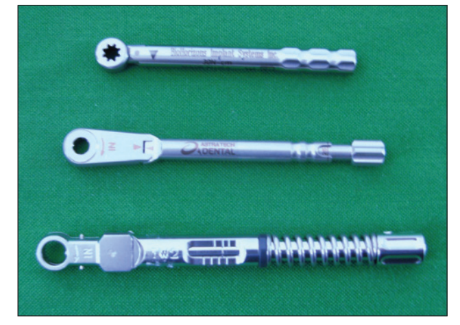
Figure 1: Friction-style mechanical torque limiting devices tested. X, Astra Tech — Y, BioHorizons — Z, Dr Idhe mechanical torque limiting devices

To simulate the clinical situation of aging, the procedure of target torque application was repeated