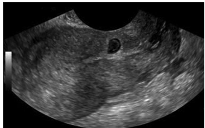
Figure 2: Transvaginal ultrasound shows cesarean section scar pregnancy with yolk sac inside

Uludag et al. compared the use of systemic and local MTX in the treatment of CSSP, and they found that the mean times for \beta -hCG normalization and the uterine-mass disappearance were significantly shorter in local MTX group than in systemic MTX group. [10]