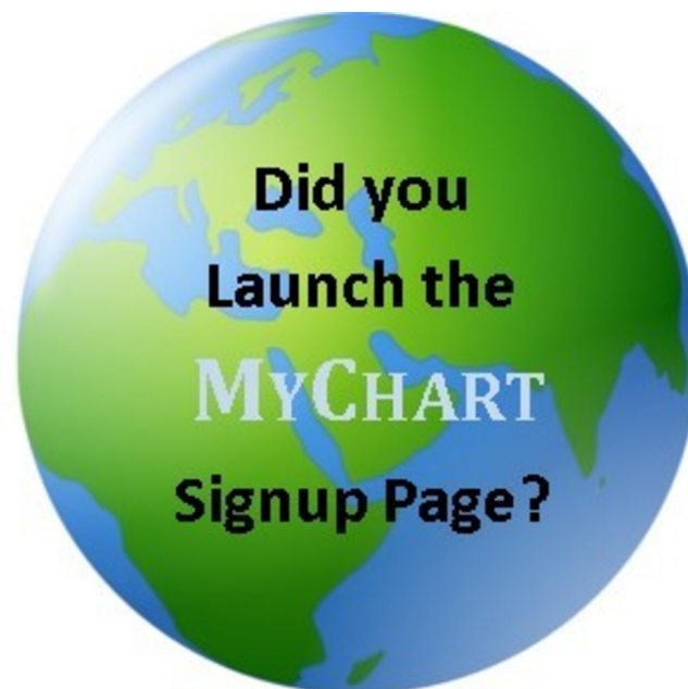
Figure 1 Visual reminder to enrol patients into portal system.

Our primary intervention was to introduce a standard patient portal sign-up process at the end of the patient rooming process. Nurses identified that one major barrier to patient portal enrolment was difficulty remembering the sign-up process in a long list of tasks necessary