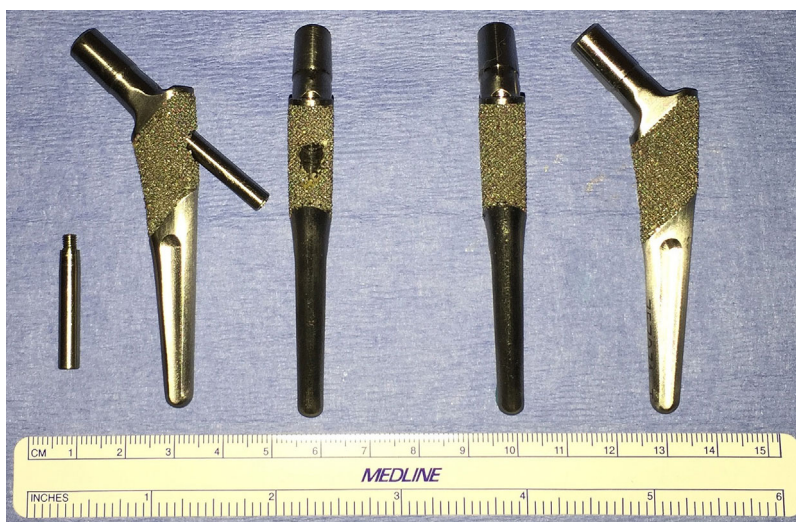
Figure 1 Orthogonal views of a size 7 interlocking biological fixation universal hip (BFX ® ) stem with 16 mm interlocking bolt (left) and traditional BFX ® stem (right).

For each pair of femora, 1 bone was implanted with a size 7, 8, or 9 Titanium BFX ® femoral stem and the contralateral bone was implanted with the same sized, but interlocking, BFX ® stem (Fig 1). Interlocking stem modifications were a 1.6 mm diameter hole through the center of the neck that was continuous with a 4.5 mm diameter threaded hole passing