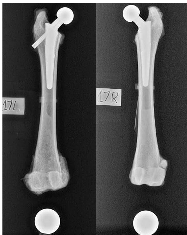
Figure 3 Postimplantation radiographs (Cd15M-CrLO) of femora with a size 7 interlocking biological fixation universal hip (BFX ® ) stem (left) and traditional BFX ® stem (right).

prosthetic femoral head, was used to transfer load to the femoral prosthesis.