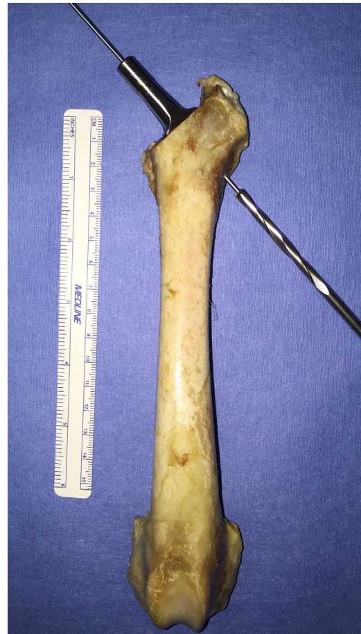
Figure 2 Surgical technique for placement of the interlocking stem's bolt. A 4.5 mm cannulated drill bit was used to drill the proximalateral aspect of the femoral cortex over a 1.57 mm diameter K-wire preplaced through the neck of the prosthetic.

After press-fit of the interlocking BFX ® stem in the femur, a 1.6 mm-diameter hole was drilled (Smart Driver, Micro-Aire Surgical Instruments, Charlottesville, VA) through the lateral femoral cortex using the hole in the prosthesis neck as a drill guide. A 1.57 mm trocar tipped, smooth K-wire (IMEX Veterinary Inc, Longview, TX) was placed in the hole through the prosthesis neck and femoral cortex. The femoral cortical hole was enlarged to 4.5 mm diameter using a 4.5 mm cannulated drill bit (DePuy Synthes, West Chester, PA) over the K-wire in retrograde fashion (Fig 2). The K-wire was removed and a 4.5 mm drill bit (DePuy Synthes) mounted on a hand chuck (IMEX Veterinary Inc.) was used in a similar direction to complete the preparation of the osseous bed by removing a small amount of cancellous bone adjacent to the implant, taking care not to damage it. Bone debris in the cortical hole was removed by injection of 10 mL of 0.9% NaCl using a 12 mL syringe and 18 g hypodermic needle. A depth gauge (DePuy Synthes) was used to ensure that interlocking bolt length would be sufficient for the bolt to protrude beyond the lateral aspect of the created cortical hole once securely locked into place. Because availability of bolts was limited in this study, some of the bolts used were longer than needed. The bolt was inserted through the femoral cortex into the prosthesis and manually locked into place using a small (2.38 mm) hexagonal screwdriver (DePuy Synthes). The stem