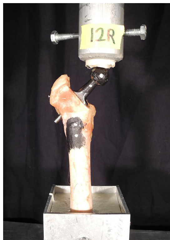
Figure 4 Interlocking biological fixation universal hip (BFX ® ) stem construct preparation and positioning in the materials testing machine. Four kinematic painted markers were used: proximal femoral on the cranial aspect of the cortex, at a distance 20% of the bone's length from the proximal aspect of the greater trochanter; distal femoral at a 1 cm distance distal to the proximal femoral marker; head of the prosthesis; and neck of the prosthesis.

Specimen constructs were mounted to the loading frame of a servohydraulic material testing machine (Model 809, MTS System Cooperation, Eden Prairie, MN) with the long axis of the femur placed parallel to the direction of loading (Fig 4). Load was applied to the prosthetic femoral head in a direction parallel to the longitudinal axis of the femur. Constructs were first loaded nondestructively, cyclically using a sinusoidal waveform at a frequency of 2 Hz at simulated walk (1200 cycles), trot (600 cycles), and gallop (600 cycles) loads (10–40%, 10–75%, and 10–155% of cadaveric body weight, respectively). 27–31 A 10% of cadaveric body weight preload was applied to comply with previously reported tests. 11,14,20 Kinematic data were acquired at 128 Hz. Specimens were completely unloaded at the end of each set of cycles to allow quantification of implant migration. After cyclic loading, constructs were loaded to failure in a single axial load