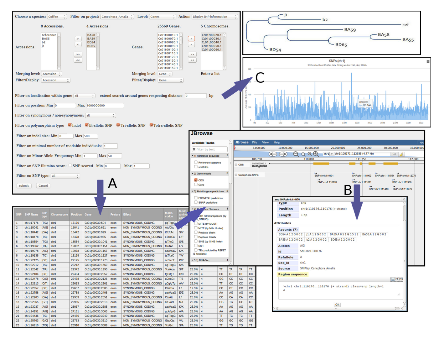
Figure 3. Management of SNP polymorphisms in the Coffee Genome Hub. (A) Users can retrieve polymorphic positions based on a subset of genotypes and a subset of genes. The database outputs SNPs together with annotations, minor allele frequency and genotypic data. (B) Connection with JBrowse allows visualizing and browsing the genomic location of the selected SNP. (C) Resulting SNPs can be sent to our tool that calculates and displays the distribution of SNP density on the genome or to a SNP-based distance tree analysis.