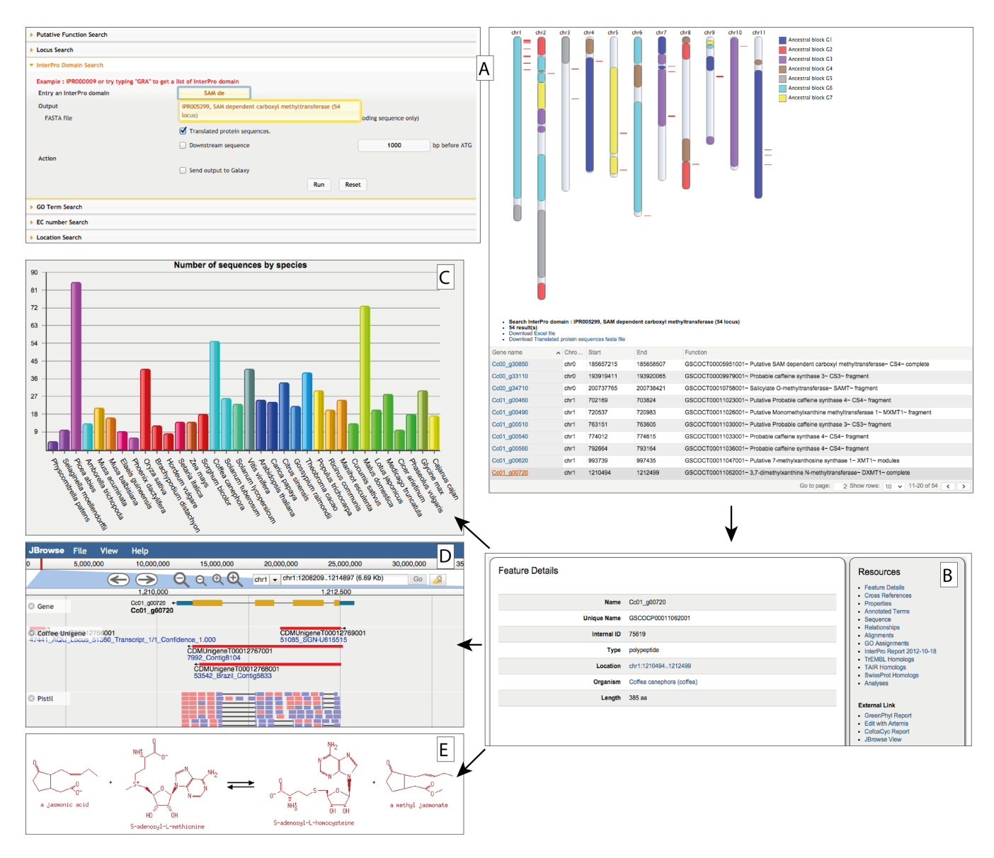
Figure 1. Overview of the Coffee Genome Hub (A) A gene search is performed with the of SAM dependent carboxyl methyltransferase (IPR005299) InterPro family identifier. The result page returns a list of genes with graphical display on the chromosomes. (B) The gene report summarizes all the data available for a gene and links to additional resources: (C) Gene family—here the distribution of the Sam Dependent Carboxyl Methyltransferase gene family (GP000195) of coffee illustrates its abundance in plants, (D) JBrowse centered on the region of selected gene ( \pm 10 kb) and (E) Pathways tools (e.g. biosynthesis of the caffeine).

protein (TAP) classification rules (35) leading to the identification of RWP-RK expansion (1). It is interesting to note that there are 211 coffee-specific clusters, ranging from 2 to 18 paralogs and 116 phylum-specific families in the Asterids sharing at least one sequence in common between C. canephora , Solanum tuberosum and Solanum lypercosicum . We identified an over-representation of the NB-ARC superfamily (724 sequences bearing the NB-ARC InterPro signature IPR002182). In addition, a high number of gene copies (47 sequences) were also detected for the Sam Dependent Carboxyl Methyltransferase family that is involved in caffeine synthesis (Figure 1).