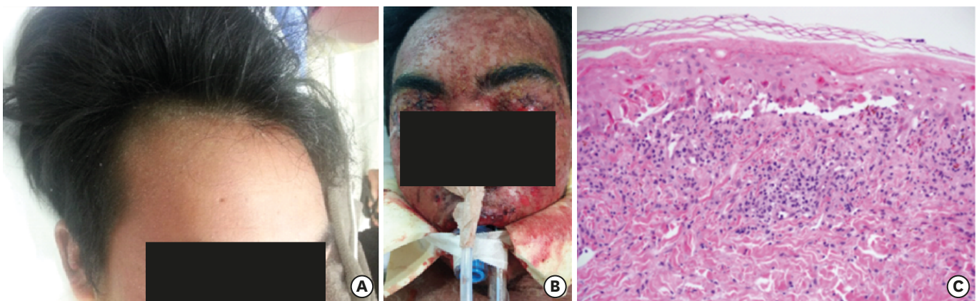
Fig. 1. Clinical finding and histologic finding on admission. (A) The patient's forehead at the admission. Rash and scales were observed on his entire body. (B) Day 4 after the admission. His skin symptoms worsened and vesicular and petechial rashes developed on his entire body, with petechial skin lesion invading the eyelids and ocular mucosa. (C) Histologic examination of the skin biopsy. Sub-epidermal bullous change and many apoptotic keratinocytes were observed in the epidermis. These findings were consistent with cutaneous drug-induced reaction (hematoxylin and eosin staining, × 200).