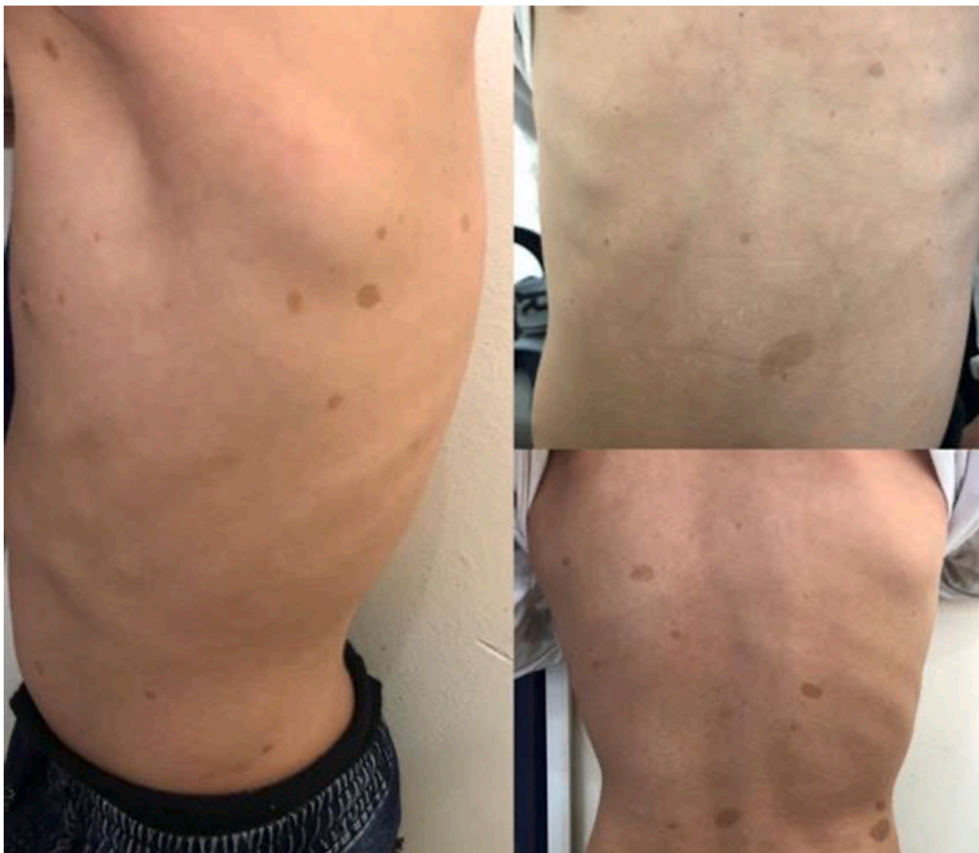
Fig. 2. Café au lait spots in the upper body of the patient.

Type-1 is the most frequent (70–80%), while 8–10% are atypical [8].