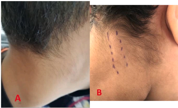
Fig. 1. A: Cervical swelling located in the right part of the neck, under the sternocleid, B: indurated cord in the posterior part of the neck.

clinical information. On the thorax, abdomen and back of the patient, the presence of eight café au lait spots larger than 5 mm and several others of small size were noted (Fig. 2). The cerebral and cervical CT showed the presence of a right retro mastoid subcutaneous mass of 40.7 mm; and a lateral pharyngolaryngeal tissue process of 59.6 mm, medial to the parotid crossed by the jugulo-carotid vessels (Fig. 3).