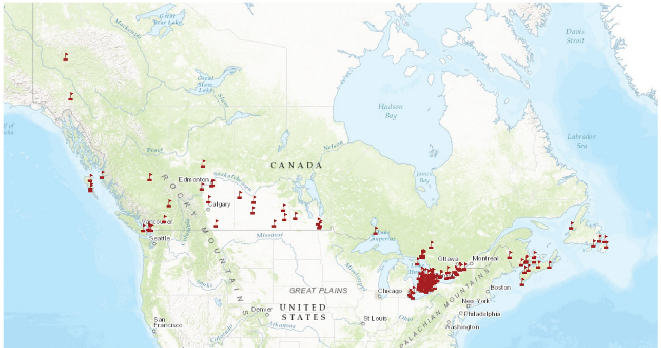
Fig 1. School Malaise Trap sampling sites from 2013–2015.

https://doi.org/10.1371/journal.pbio.2001829.g001