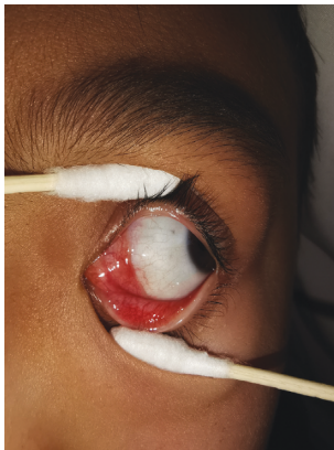
FIGURE 2: The healing of the conjunctival microincision.

BTXA: botulinum toxin A, PD: prism diopters.