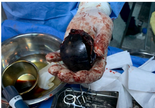
Fig. 3. The extracted foreign body (plastic ball).

skin incision was made, abdominal wall layers were opened layer by layer. Adhesiolysis was necessary to reach the sigmoid and properly identify the rectum. The foreign body was then felt deep in the pelvis, impacted in the rectum. An attempt to push the impacted ball downwards through the rectum and facilitate transanal extraction was fruitless. Unfortunately, the foreign body was tightly wedged in the pelvis, thus moving the impacted ball upwards was also unsuccessful. After several hours of unproductive efforts to move the ball or change its position, colorectal and orthopedic surgeons were consulted but no solution was provided. At this point, was decided to carefully cut the foreign body into smaller pieces to be extracted. This was done by puncturing the ball with an electric drill used in orthopedic operations, after inserting it through the dilated anus, and connecting the holes together with great caution using a bone cutter. After several hours of working very carefully to avoid rectal injury, the foreign body was broken into 3 main parts which relieved the impaction and made it easy