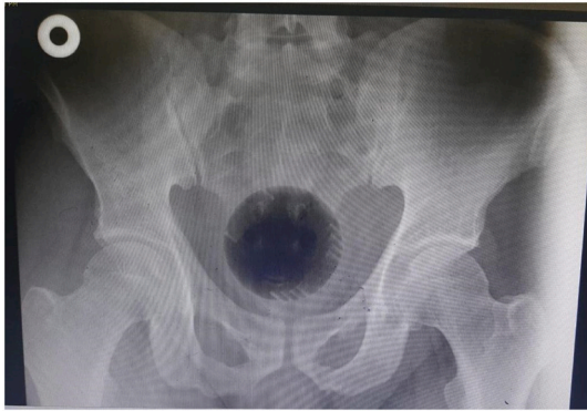
Fig. 1. X-ray showing a round-shaped foreign body in rectum.