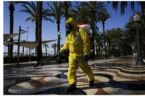
Figure 3. A lone worker disinfects the promenade of the Explanada in Alicante. Why fumigate if there is no one in the street?