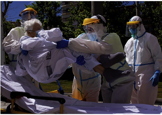
Figure 12. The photograph captures the dizzying moment when an elderly patient is lifted onto a stretcher.

masks, and gloves. In a rhythmic movement, skillfully captured by the photojournalist, they place an elderly woman on a stretcher, energetically lifting a white sheet in which the Valencian Generalitat logo appears. The woman is also wearing a mask and socks, but no shoes.