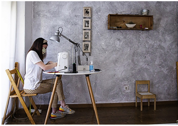
Figure 7. A young woman, with a mask, inside her house, making masks in solidarity.