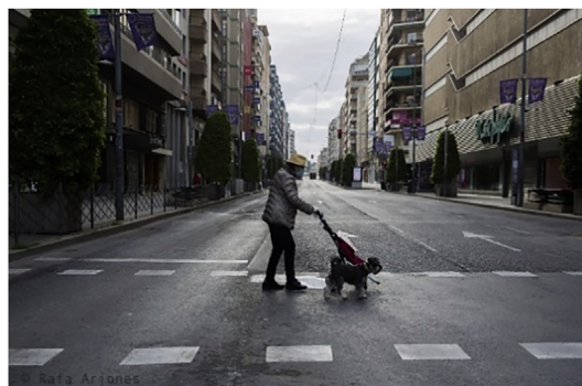
Figure 6. Despite the fact that there is no traffic, an elderly man, accompanied by his dog, crosses disciplinedly through the crosswalk of a central commercial street in the city.

areas or neighborhoods of the city. And it is that they are locked up and incommunicado and the city itself -its spaces and places-cloistered and fragmented, without forgetting that its usual dynamism and its daily rhythms -time- have been retained. On the other hand, the image reveals that the traffic cannot be fulfilled since there are no vehicles. For this reason, Rafa Arjones also suggests that the norms established for an ordinary society may not be valid in this critical circumstance or, even, that we are not able to see, even if we have them in front of us, the signs that indicate the way or the exits to take before a crisis of such magnitude (see Figure 6).