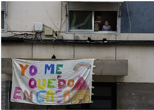
Figure 9. Neighborhood residents call for compliance with government regulations put in place during the pandemic.

the window, a fabric banner, probably made by the girl, has a house painted, a rainbow above it, and the phrase with colored letters “I stay home,” a slogan that became popular in Spain - and in other countries. 26 to make the population aware of the need to keep confinement for the good of collective health.