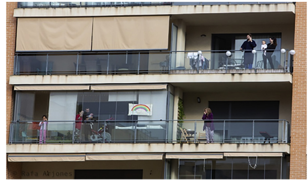
Figure 8. The facade of a multi-story building, whose balconies different stories of communication and non-communication, individualism and community spirit are taking place.

In image (8) can be seen the facade of a multi-story building, whose balconies overlook its inhabitants. The photograph freezes an instant of the daily life of the inhabitants of a building in the city when they are confined to their homes. Below, on the left, we have a family made up of four people, who come out onto the balcony together: the mother