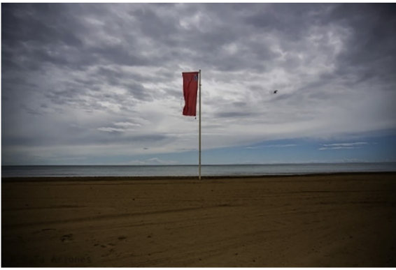
Figure 2. The Postiguet Beach in Alicante, clean and ready for citizens to bathe. On the contrary, the red flag indicates the prohibition to do so.

quality of life of older people and, in short, of the pride of a western society that believed that took proper care.