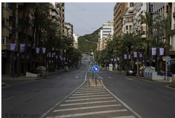
Figure 5. A central Alicante street emptied by the pandemic, without pedestrians or cars. Despite the fact that there are no vehicles circulating, the photojournalist highlights the traffic signs in the center of the composition.

outside, outdoors, outside the house, and participate emotionally and bodily in the usual processions. The hard ritual path of descent, first, and later, of ascent through the cobbled steps made by the members of the brotherhood with the heavy throne of Christ has not been able, therefore, to leave the hermitage that is above nor to carry out the return to it. Therefore, the party, without origin or destination, has therefore not been able to recreate the eternal return that it manifests and has been canceled, while the street has not been able to exercise its traditional function of touring the myth. Nor have citizens been able to “breathe” the city’s historical air and its traditions, nor put into practice the “effervescence” or the “emotional energy” 19 , with which the Society is periodically renewed (see Figure 5).