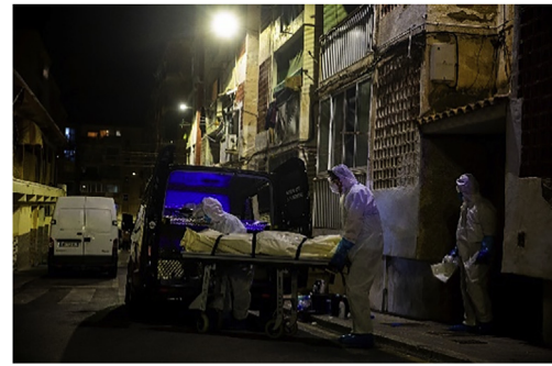
Figure 13. Two 90-year-olds die, alone, unnoticed by any neighbors, during confinement due to Coronavirus. With the permission of the photojournalist (Rafa Arjones).

The knowledge of these events has shocked a part of Alicante society and also the photojournalist himself, who has empathetically characterized the gloomy and sadness of the scene with the dim lighting of the bodies, the professionals, the vehicle, and the only lamppost on the street. In addition, the wall of the building where they lived, which barely remains standing and lacks some of the basic elements that the