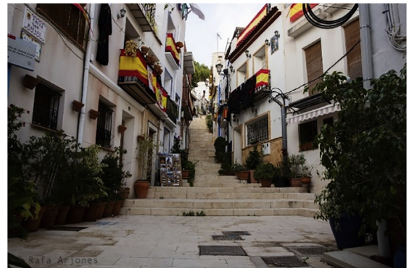
Figure 4. The historic Santa Cruz neighborhood is ready to celebrate Holy Week; however, its streets are empty, so neither citizens can celebrate their festivities nor visitors can tour the historic city.

almost nothing about the virus, how it mutates, spreads, enters people, begins to alter their cells, and, above all, how to cure it (see Figure 4).