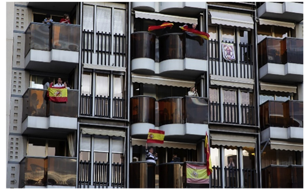
Figure 10. In a wealthy neighborhood, residents protest against government measures with national flags.

In the swooping image of this lady, the rectangular opening through which she walks contrasts, due to its diagonality, with the other linear rectangle of the photographic frame. The frame highlights her “cloistered” by the iron fence and the narrow concrete walls of the building and the semi-somber and gray tone, along with the abundant darkness present in the margin of image, which reinforces her representation of solitude and confinement and the sadness that this supposes. Indeed, she cannot walk on the street, receive sunlight, and she only moves through a narrow place, without joy, one might say. Also, she must do it alone, without talking to anyone, to which is added that, the perspective with