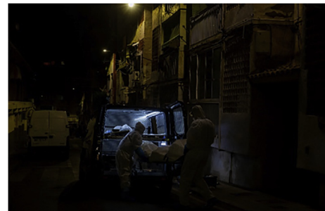
Figure 14. The scene takes place in a dimly lit street, at night, which gives a more sinister character to the moment when the corpses are being collected.

dignity of a home requires, helps to visualize the indigency of its inhabitants and the abandonment to which society has subjected them 31 .