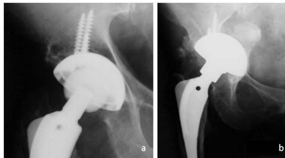
Figure 2 Radiolucent lines in DeLee zone 1 directly after cup implantation (Plasmacup SC, size 58 mm) without bone graft transplantation (a). Complete regression after ten years postoperative (b).

that additional cancellous bone in the form of chips was taken from the patient's equilateral iliac crest. The amount of autogenous bone material available for defect replenishment was not sufficient in 9 patients, so that additional allogenic cancellous bone chips from donor femoral heads were used. There was no difference in the clinical result between patients who received intraoperative bone graft transplantation and those whose defects were not intraoperatively replenished with bone.