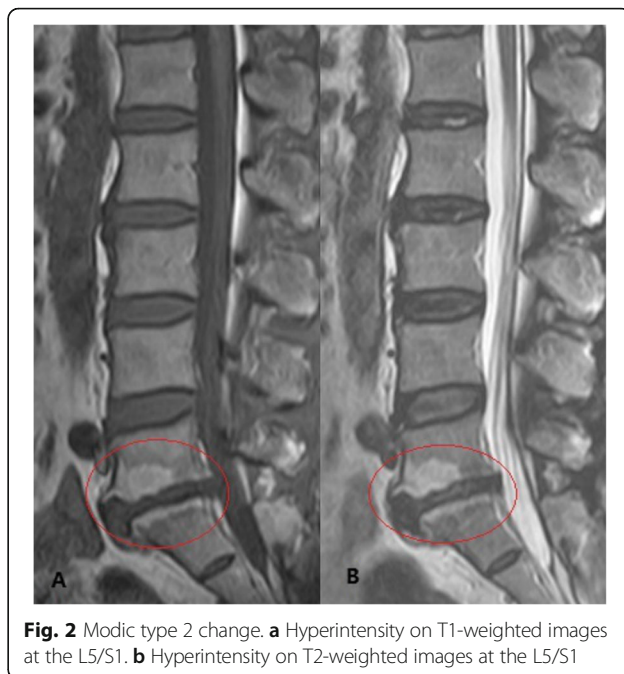
Fig. 2 Modic type 2 change. a Hyperintensity on T1-weighted images at the L5/S1. b Hyperintensity on T2-weighted images at the L5/S1

The measuring parameters in this study were as follows (Fig. 3): (1) lumbar lordosis (LL), formed by two oblique lines that were drawn through and parallel to the L1 and S1 upper endplate, respectively; (2) sacral slope (SS), assessed through the intersection of lines parallel to the sacral base and ground; (3) intervertebral height index (IHI) = (the height of anterior disc + the height of posterior disc)/(superior disc width + inferior disc width); (4) intervertebral angle (IVA), which was the intersection of two lines through and parallel to the upper and lower