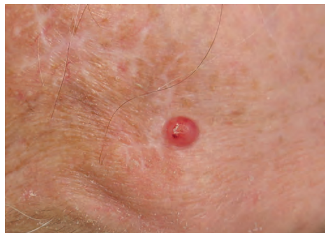
FIGURE 2: Shiny, erythematous papule with a central depression on the patient's forehead