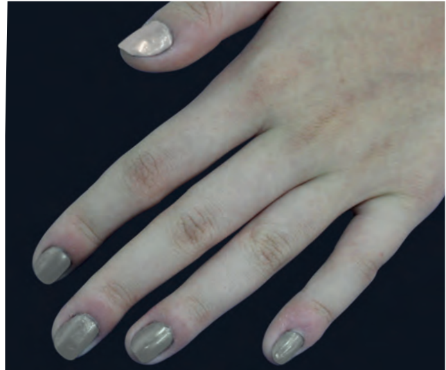
FIGURE 2: Left hand with significant improvement after treatment

some time, immunotherapy has been studied in dermatology, especially in the treatment of recalcitrant viral warts, which includes topical, intralesional, or systemic treatments. It is theorized that the application of topical immunomodulators induces delayed-type or type IV hypersensitivity reactions. As a consequence, Th1 cells release cytokines that cause the recruitment of macrophages and natural killer cells that induce the death of infected keratinocytes. 2 This reaction would justify the reduction of warts after sensitization on the back skin, even without direct application in the periungual region.