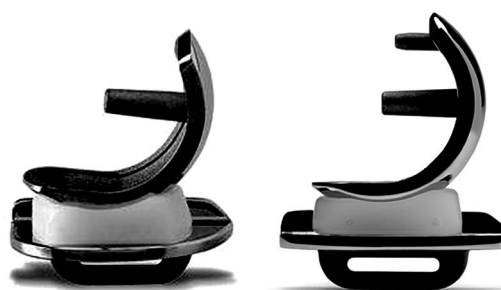
Figure 1. The Oxford UKR with Single and Twin Peg femoral component.

The most commonly used UKR is the Phase 3 Oxford UKR. The initial Phase 3 femoral component, like its predecessors, was spherical and cemented. It had a single peg that was thought to be helpful as it allowed the component to seat optimally (Figure 1). However, as 25–50% of aseptic loosening was femoral (Mohammad et al. 2018), it was felt that the introduction of a Twin Peg component that might improve fixation would be advantageous. During surgery a small hole is made in the femur anterior to the main peg hole to stabilize the femoral saw guide. A second peg, which would fit in the small hole, was therefore added, allowing the new component to be used with standard instrumentation. In order to support the peg, the spherical part of the component was extended about 15° further anteriorly. To accommodate this extension more bone is removed anteriorly, which decreases the risk of the bearing impinging. This also allows the femoral component to be implanted in increased flexion.