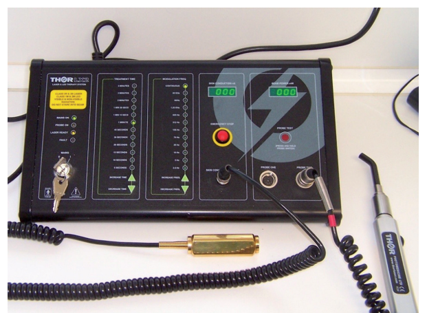
Fig. 1: Diode laser THOR LX2 ® (Thor Photomedicine Ltd, Chesam, London).

Age, gender, smoking and plaque index were gathered. For the 2 test teeth and the 2 control teeth: recession (the highest point), probing (of the highest point of recession) and the degree of dentin hypersensitivity using visual analog scales (VAS) for tactile stimulation (touching the