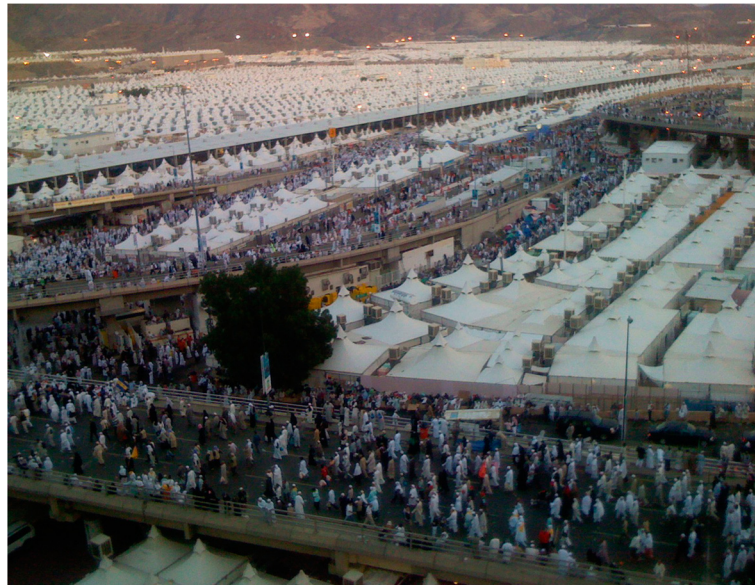
Figure 1 Tent housing facilities located in Mina inundated by pilgrims.

worldwide and 11 million people require hospitalization. Treatment failure rates for pneumonia are as high as 15% [3-5]. Death rates from CAP increase with the presence of co-morbidities such as chronic heart failure, advanced chronic obstructive pulmonary disease (COPD), neurological diseases, cirrhosis, and advanced age [6-8].